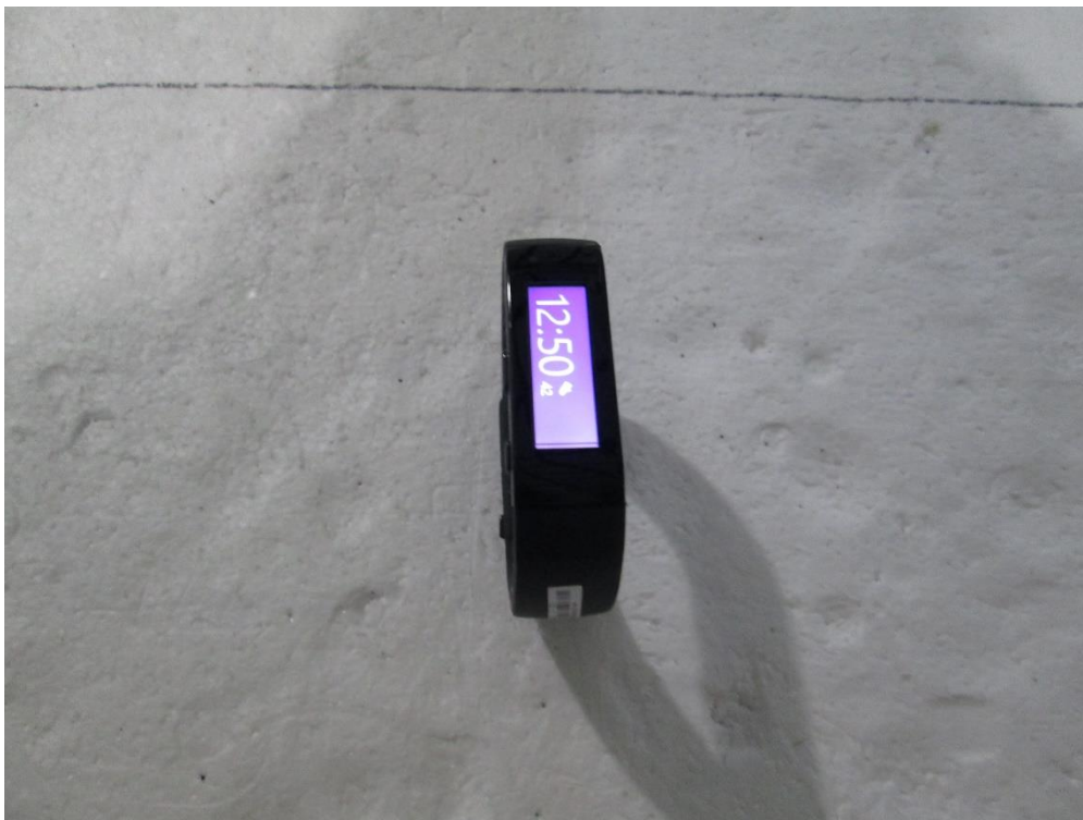
Fig.2 Radiated Emissions EUT Setup (Standing)