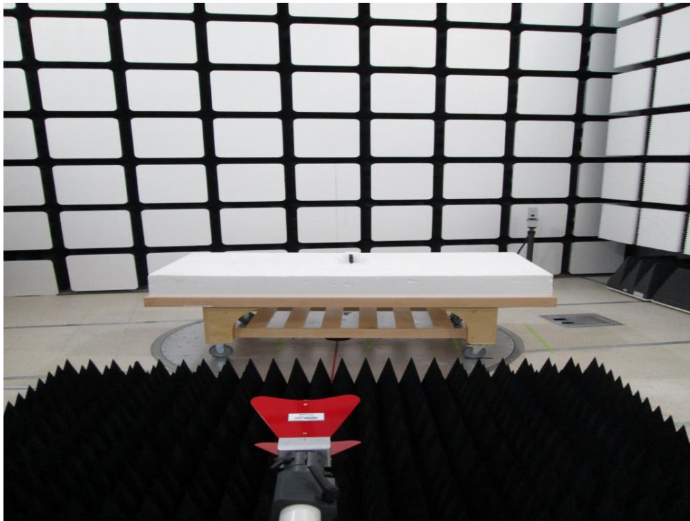
Fig.5 Radiated Emissions Test Setup (>1 GHz)