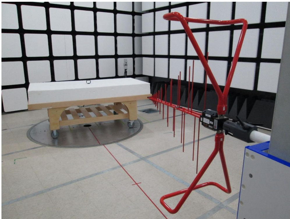
Fig.4 Radiated Emissions Test Setup (30MHz – 1GHz)