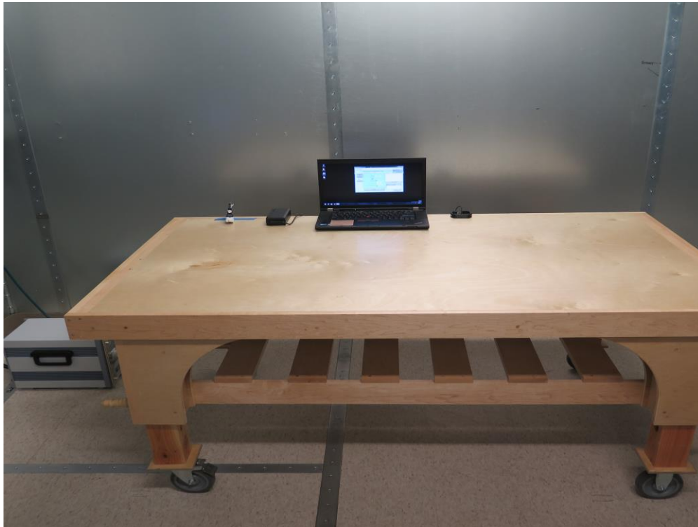
Fig.7 AC Line Conducted Emissions Measurements Test Setup