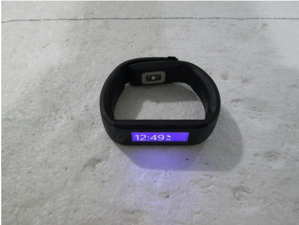
Fig.1 Radiated Emissions EUT Setup (Flat)