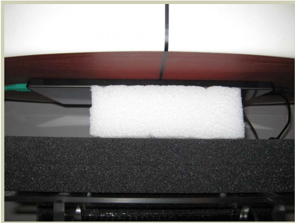
Back of Tablet