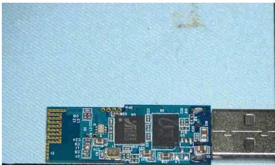
Antenna Type : PCB Antenna , Antenna Gain : 3.2dBi