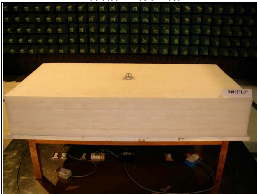
Radiated Emission Test