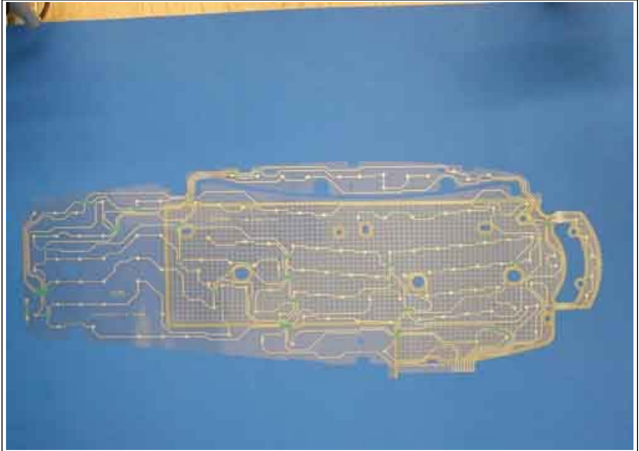
Bottom Trace Bottom