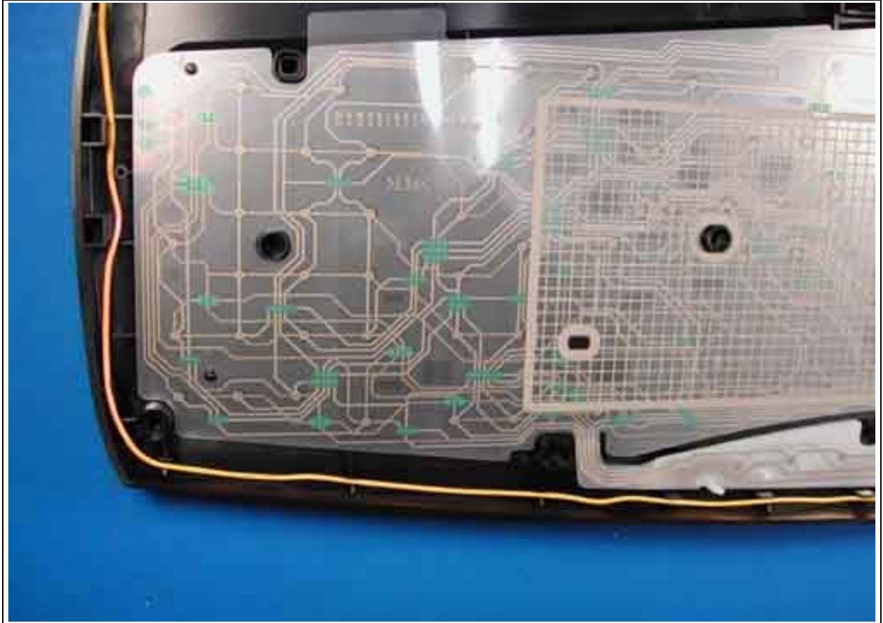
Left Traces Both Layers