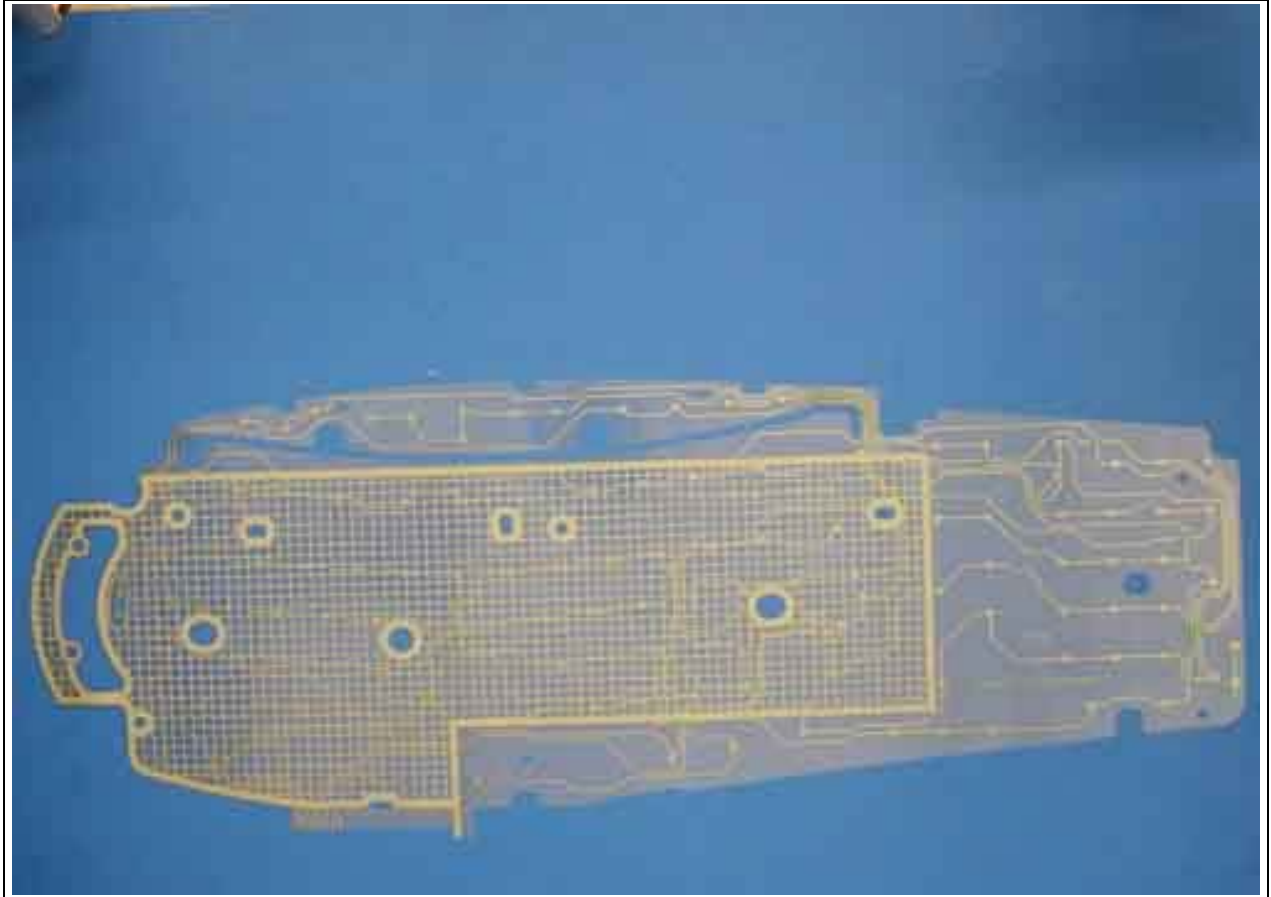
Bottom Trace Top