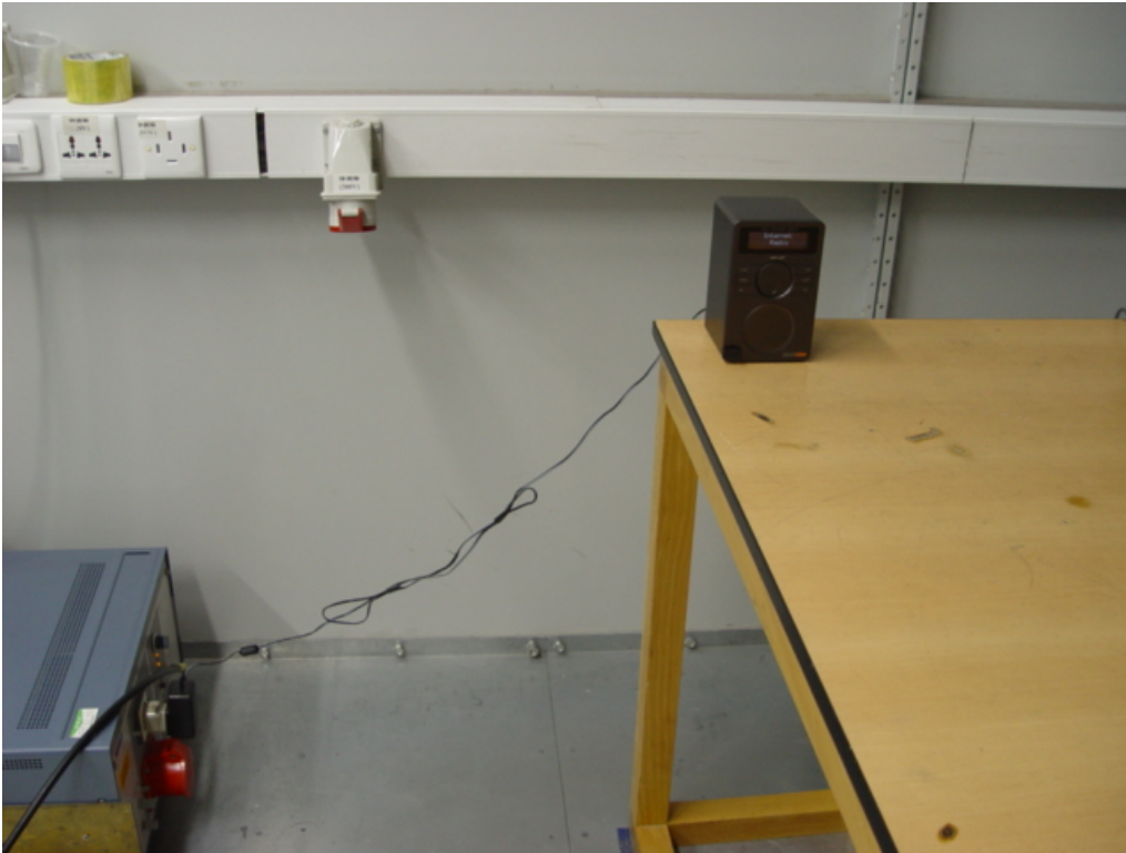
Photo 2 Radaited Emission Test