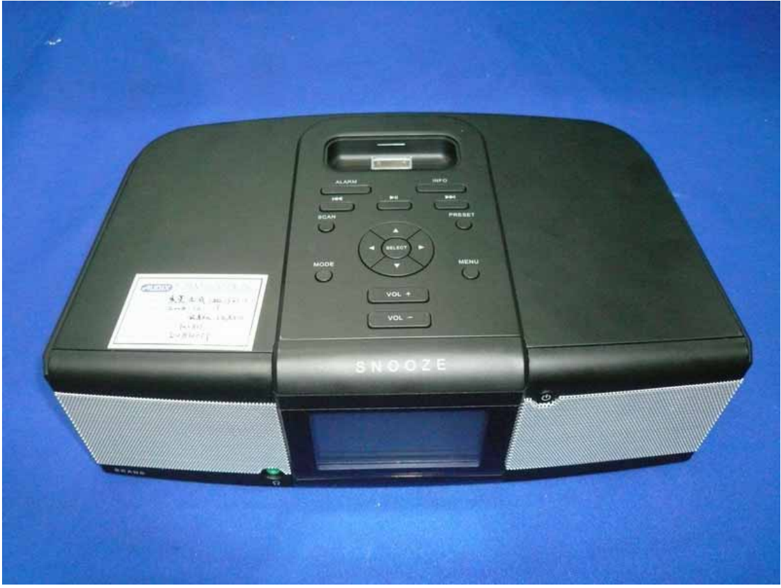
Figure 2 General Appearance of the EUT