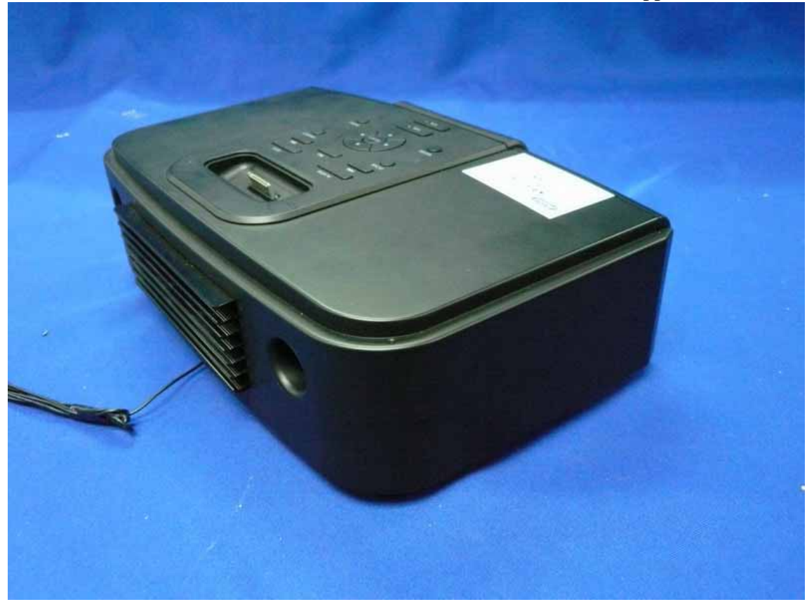
Figure 6 General Appearance of the EUT