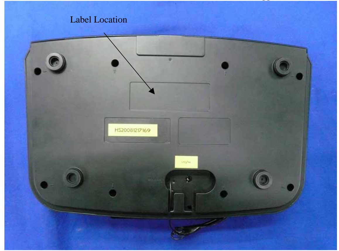
Figure 8 Inside of the EUT