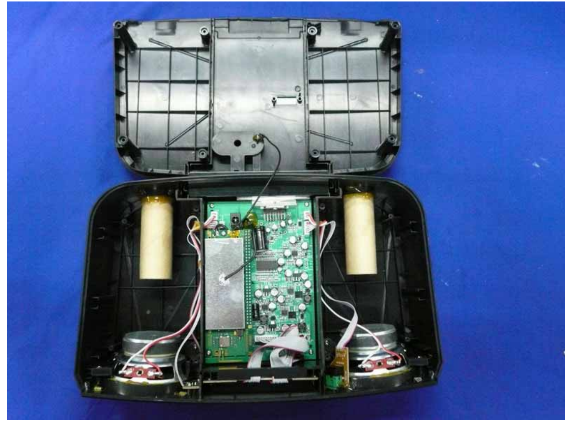
Audix Technology (Shenzhen) Co., Ltd. Report No. ACS-F09004