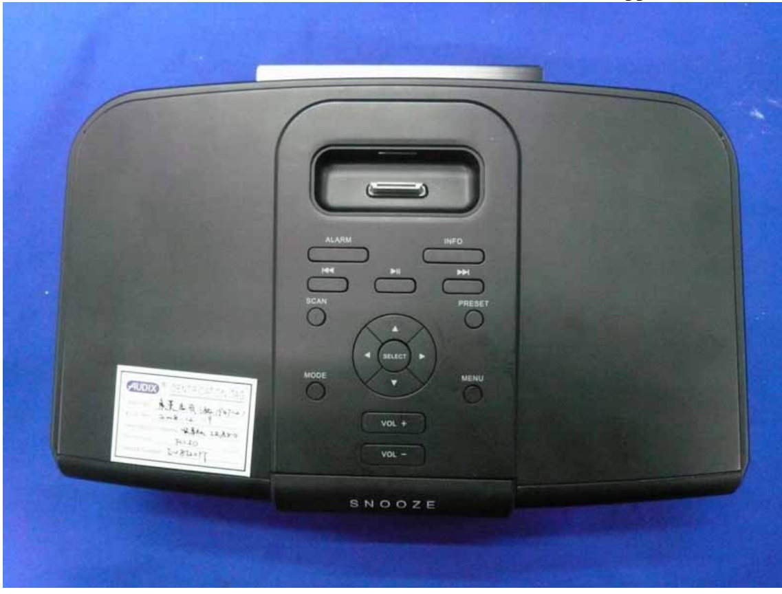
Figure 4 General Appearance of the EUT