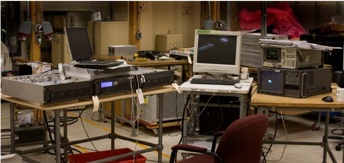
Amplifiers, and power supply (left), test equipment (right)