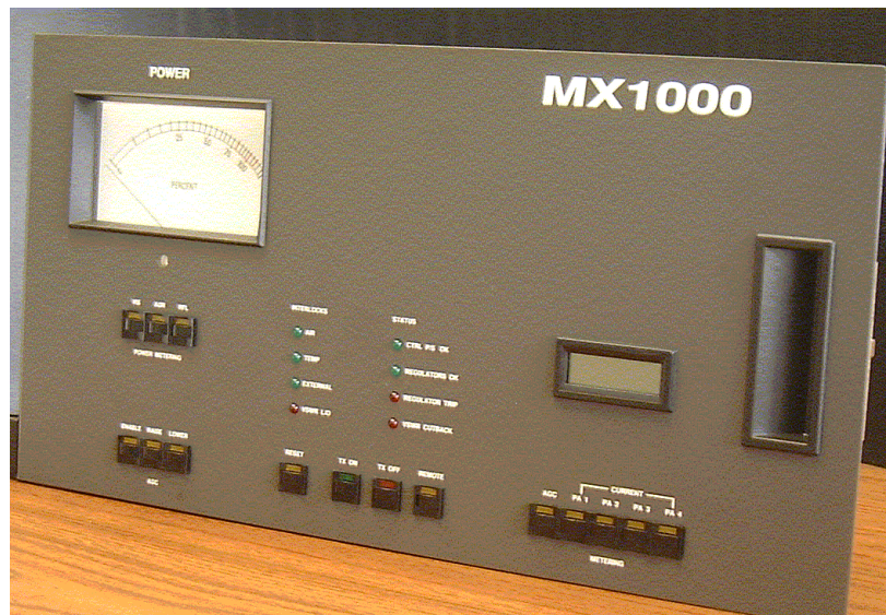
Figure 1 Front Panel

The control system handles all the interlocking control, protects the transmitter against excessive VSWR and displays power supply status. Meters are provided for monitoring output power, reflected power, P/S currents and AGC voltage.