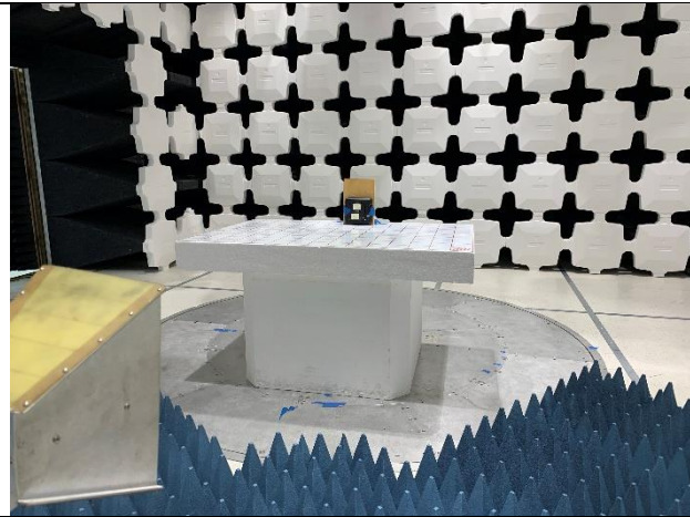
RE Above 1GHz – Front View