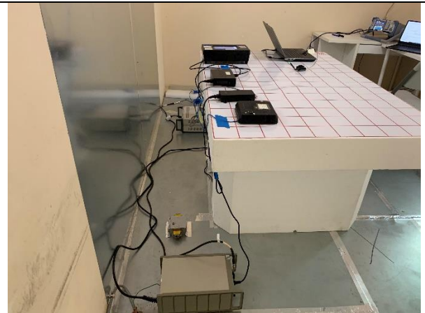
AC Line CE – Rear View