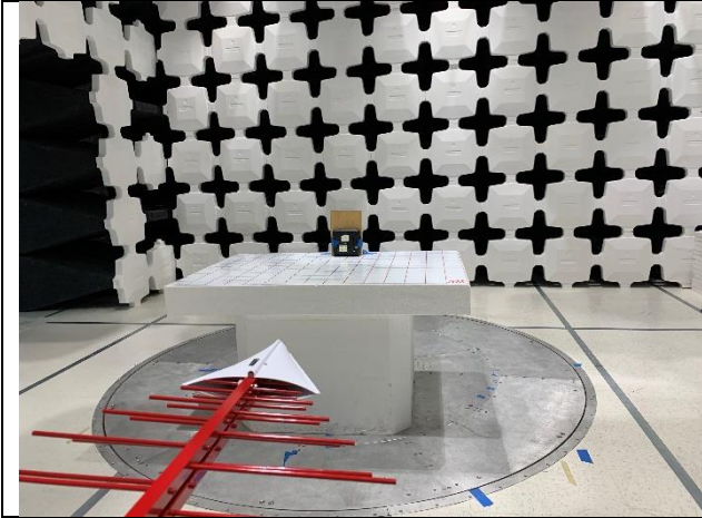
RE Below 1GHz – Front View