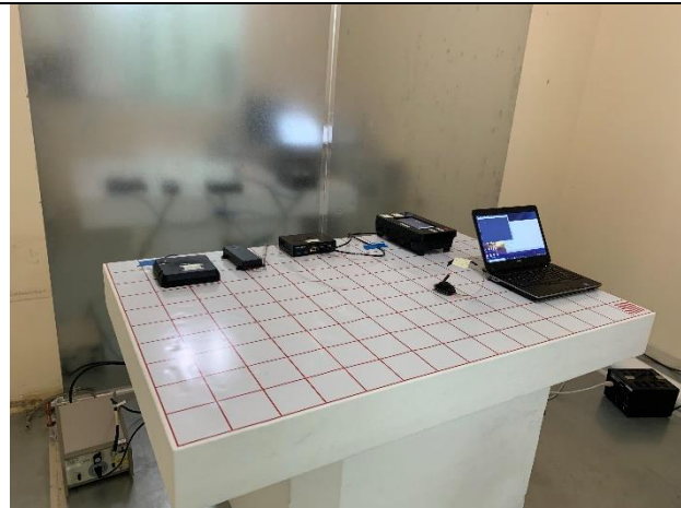
AC Line CE – Front View