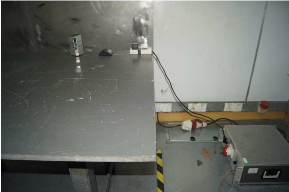
Photograph 2: Set-up for Spurious Emissions (9kHz-30MHz)