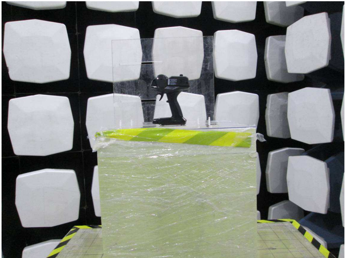
Above 1GHz (The EuT placed at the center of the turntable)