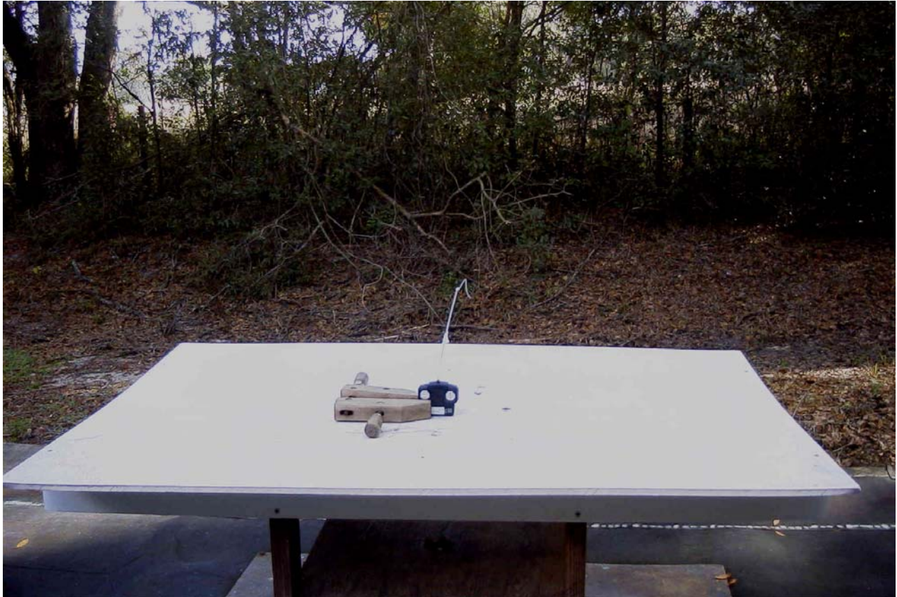
TEST SET UP PHOTO

888.472.2424 F 352.472.2030 email: tei@timcoengr.com