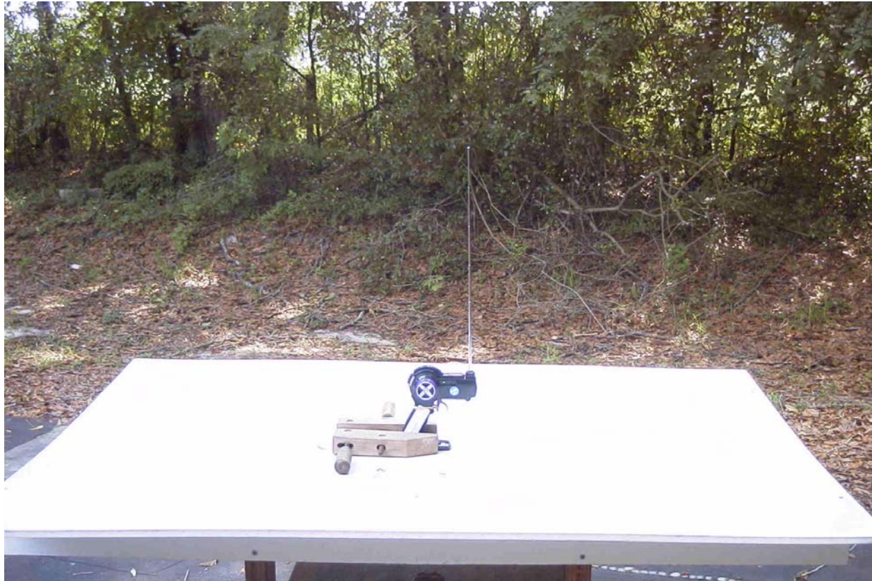
TEST SET UP PHOTO

APPLICANT: SCIENTIFIC TOYS, LTD. FCC ID: BY34204-27SP REPORT #: S\SCIENTIF\1261HUT6\1261HUT6TestReport.doc