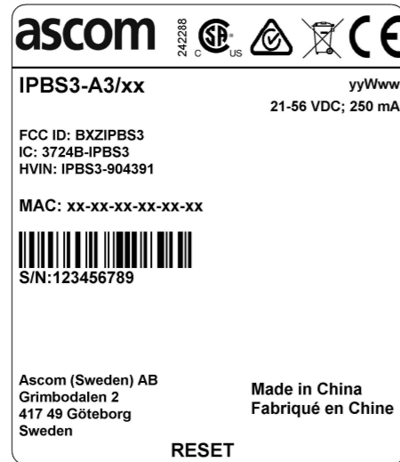
Label type: IPBS3 Product label Total size: 58.6*68.4 mm