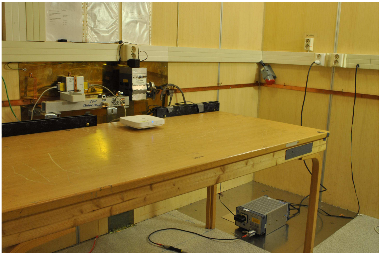
Power line Conducted Emissions Test