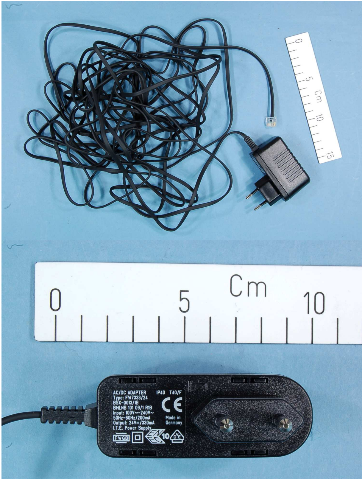
Power Adaptor for Conducted tests