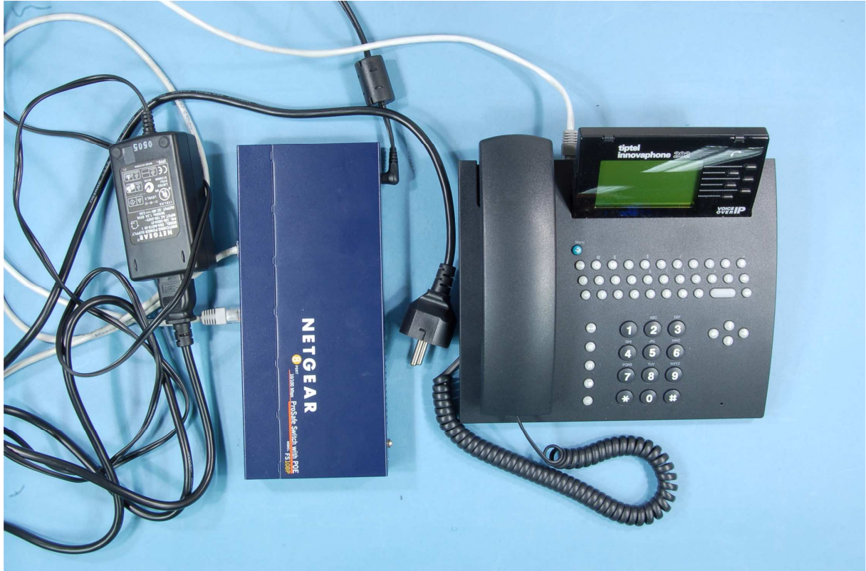
Ethernet Switch with Power over Ethernet