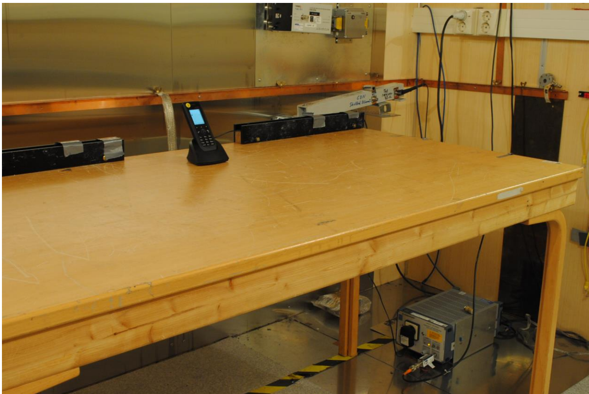
Power line Conducted Emissions Test