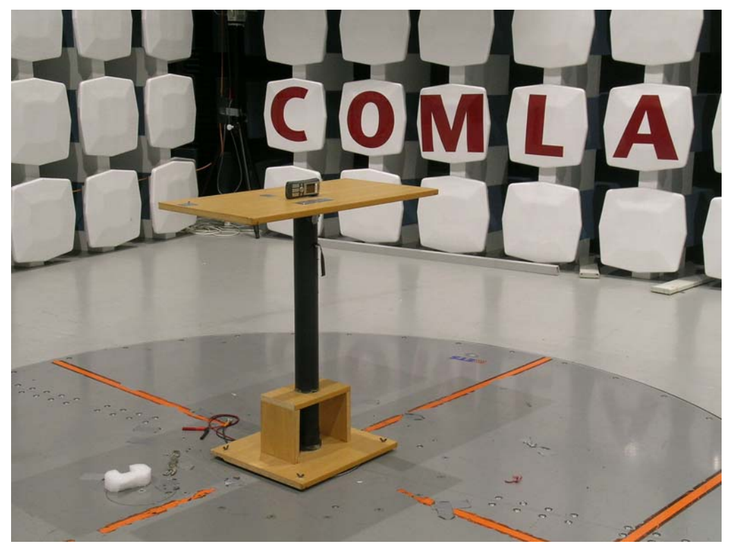
Test set-up for radiated measurements – XZ plane