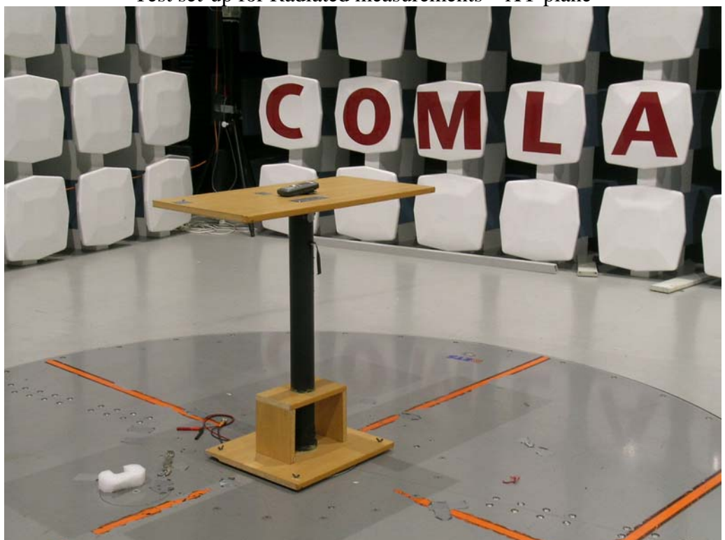
Test set-up for radiated measurements – YZ plane