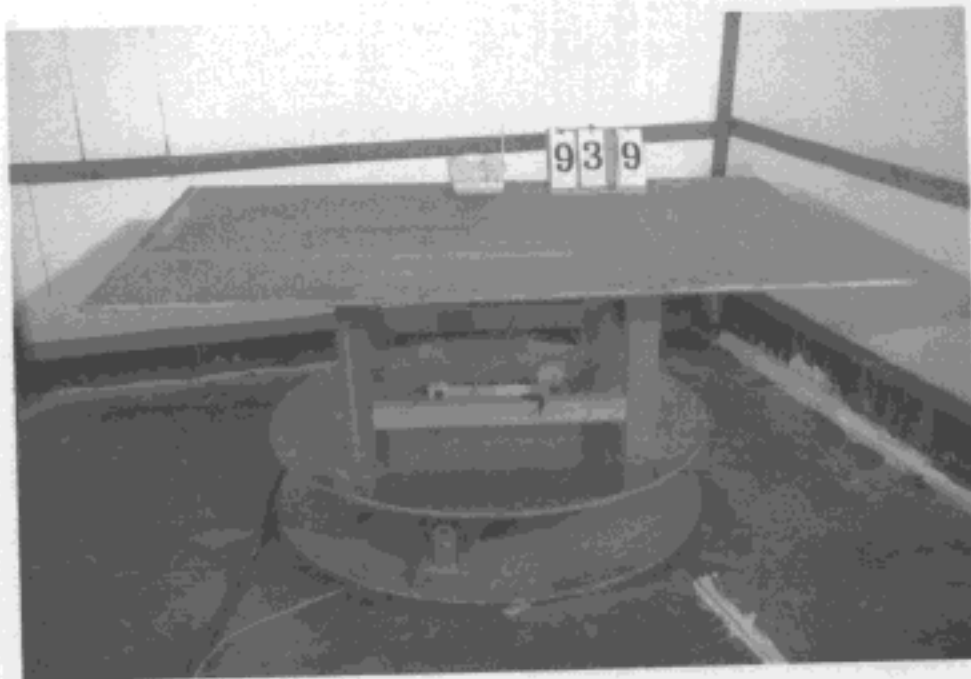
Fig 1 Front View of the Test Configuration ( BASE )