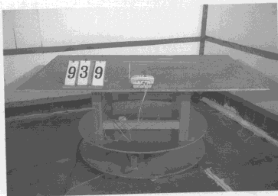
Fig 2 Rear View of the Test Configuration ( BASE )