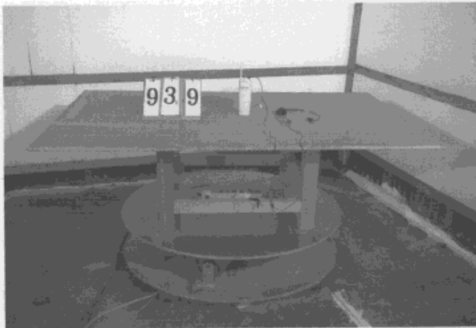
Fig 2 Rear View of the Test Configuration (HANDSET)

The test configuration for frequency between 1 GHz to 18 GHz is same as above.