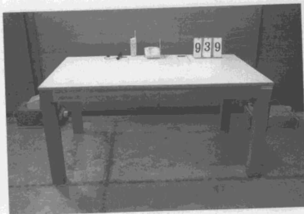
Fig. 4 Conducted emissions test placement (operating only)