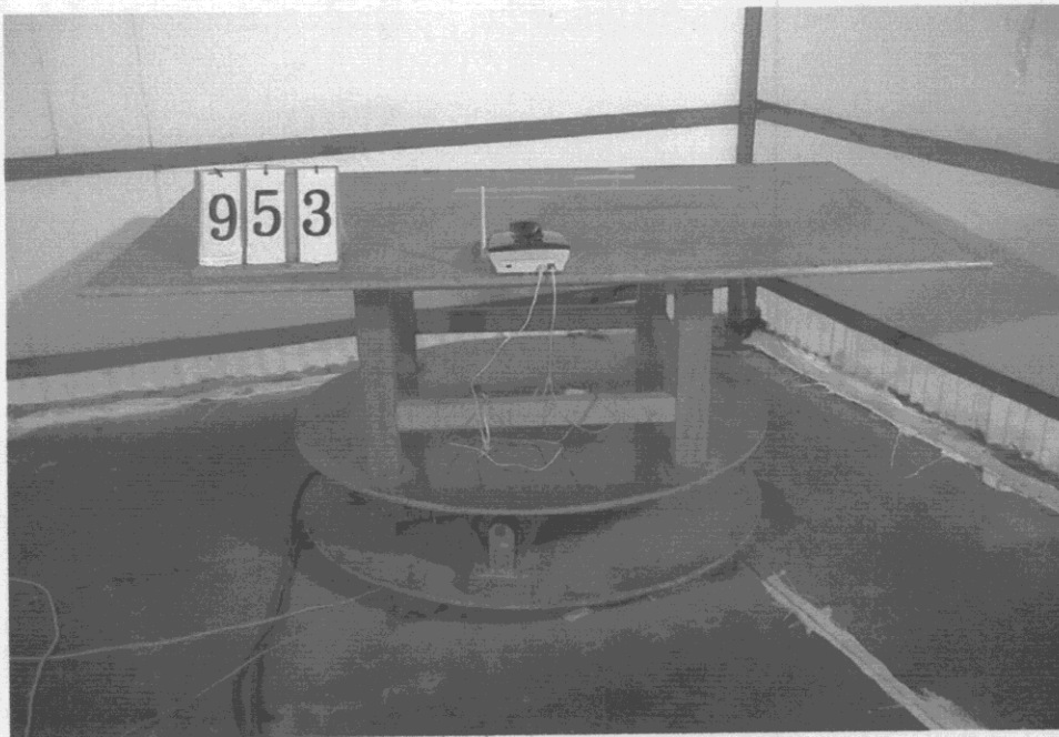
Fig 2 Rear View of the Test Configuration ( BASE )