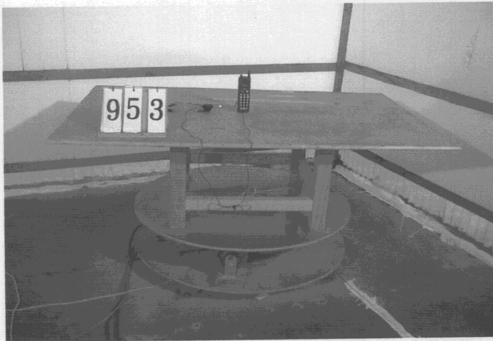
Fig 1 Front View of the Test Configuration (HANDSET)