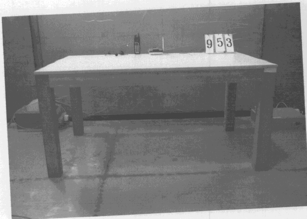
Fig. 4 Conducted emissions test placement (operating only)