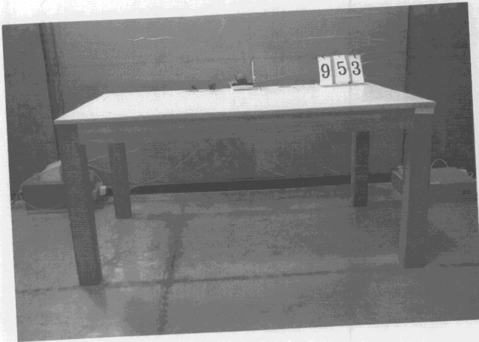
Fig. 3 Conducted emissions test placement (idle only)