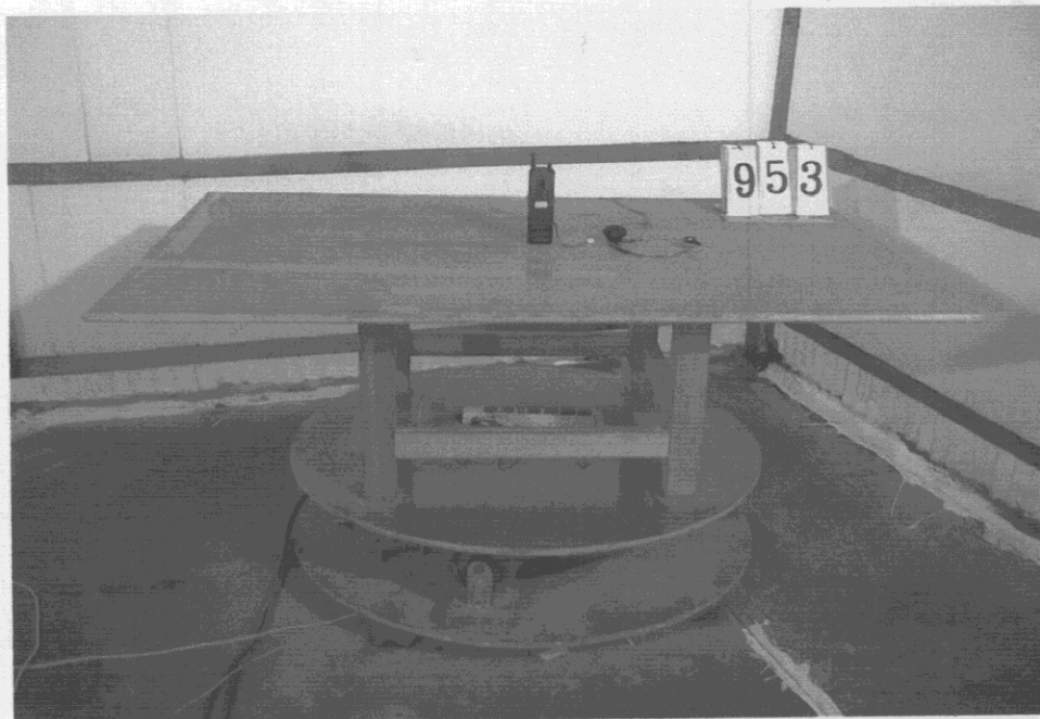
Fig 2 Rear View of the Test Configuration (HANDSET)

The test configuration for frequency between 1 GHz to 18 GHz is same as above.