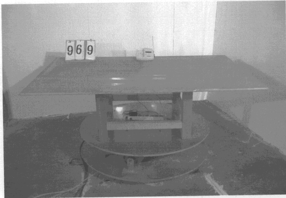
Fig 1 Front View of the Test Configuration ( BASE )