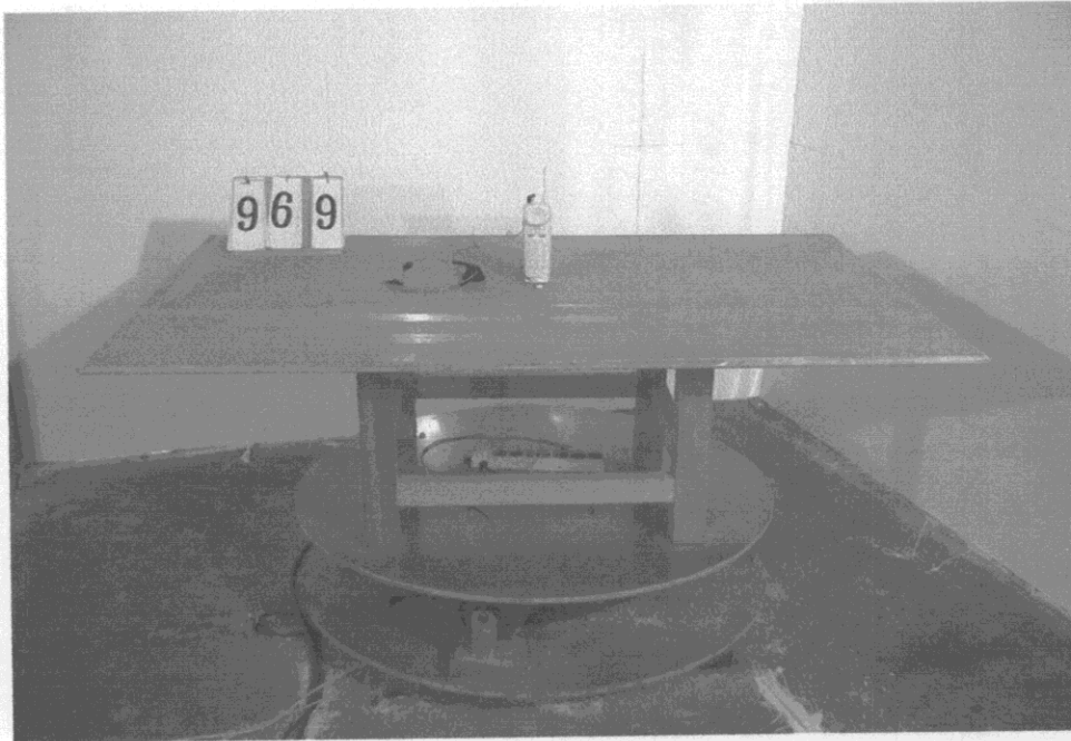
Fig 1 Front View of the Test Configuration (HANDSET)