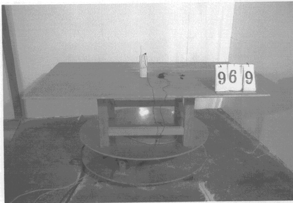
Fig 2 Rear View of the Test Configuration (HANDSET)

The test configuration for frequency between 1 GHz to 18 GHz is same as above.