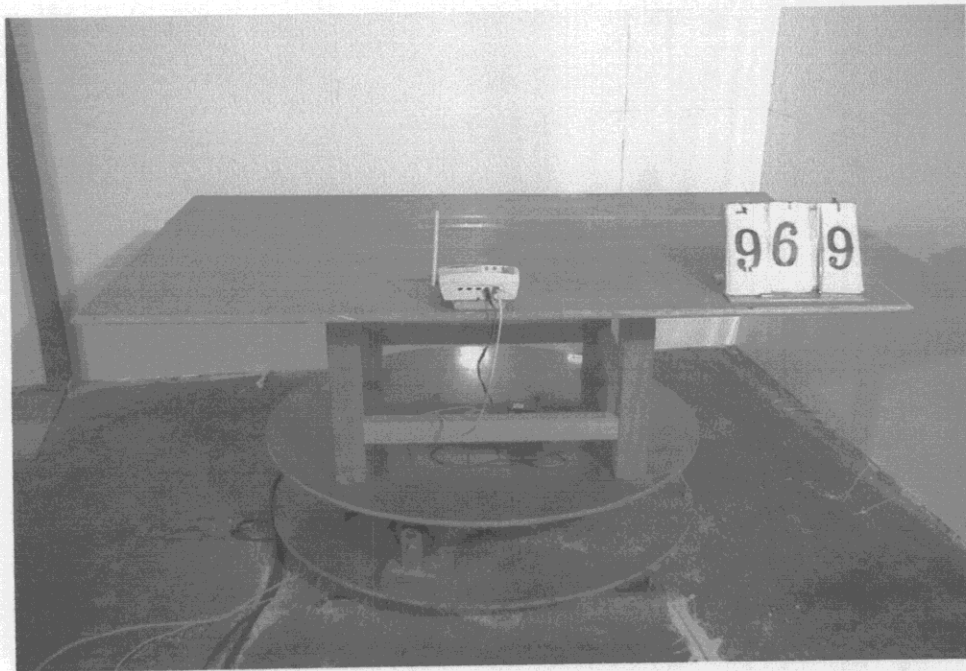
Fig 2 Rear View of the Test Configuration ( BASE )