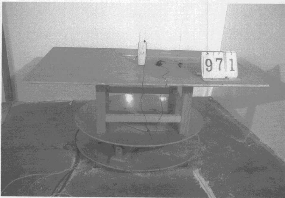
Fig 2 Rear View of the Test Configuration (HANDSET)

The test configuration for frequency between 1 GHz to 18 GHz is same as above.