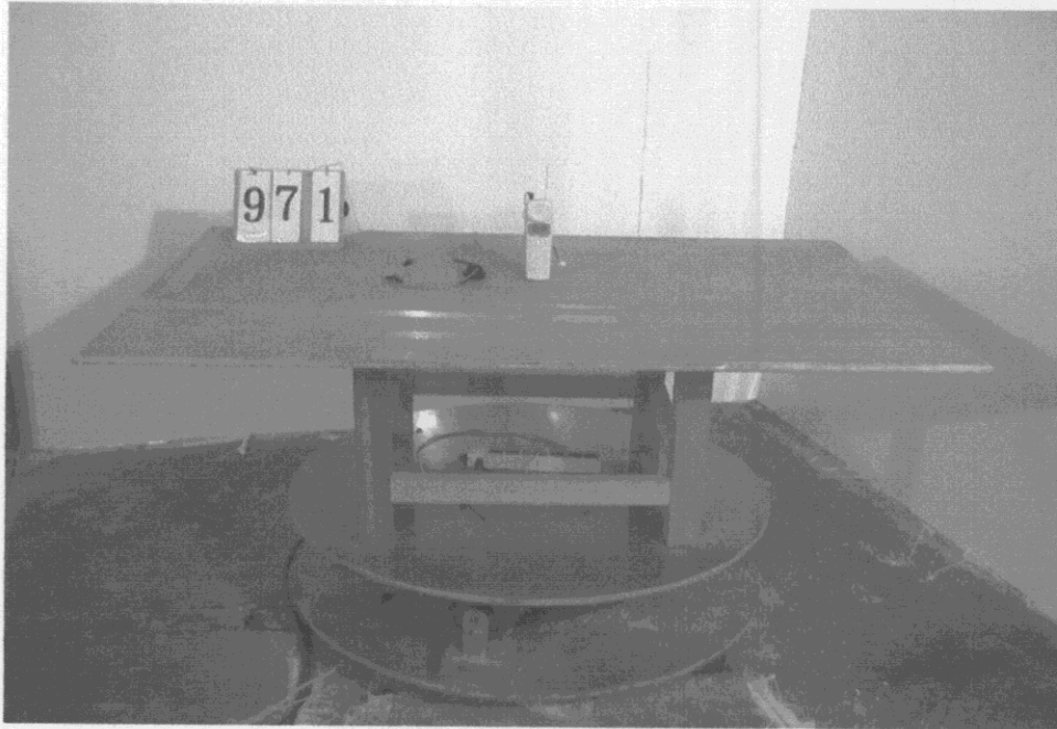
Fig 1 Front View of the Test Configuration (HANDSET)