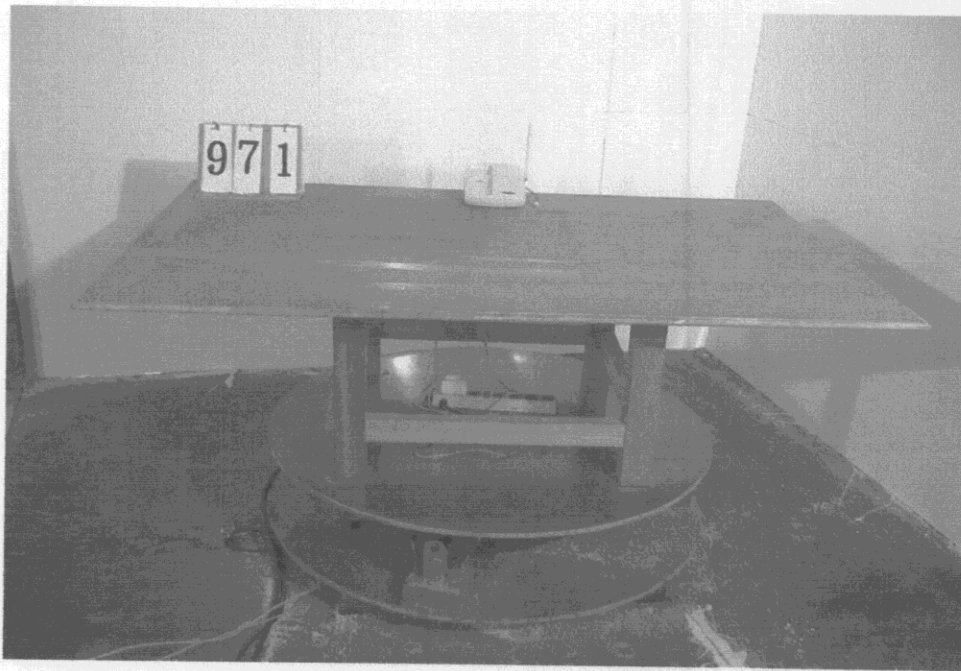
Fig 1 Front View of the Test Configuration ( BASE )