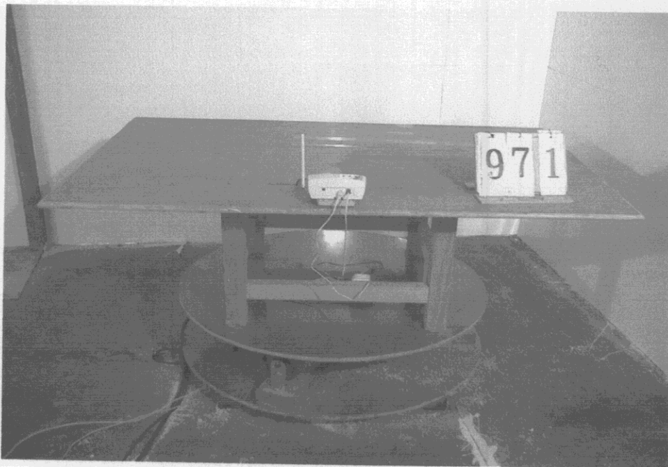
Fig 2 Rear View of the Test Configuration ( BASE )