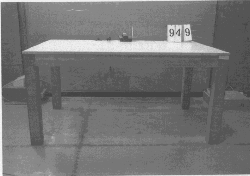
Fig. 1 Conducted Emissions Test Configuration (Idle only)