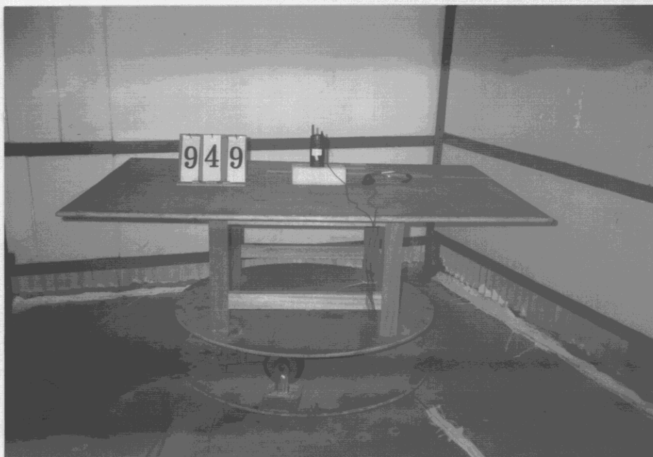
Pic 2 Rear View of the Test Configuration (HANDSET)

The test configuration for frequency between 1 GHz to 18 GHz is same as above.