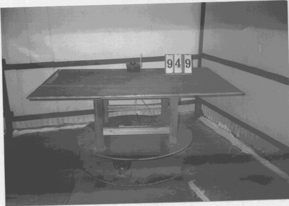
Pic 1 Front View of the Test Configuration ( BASE )