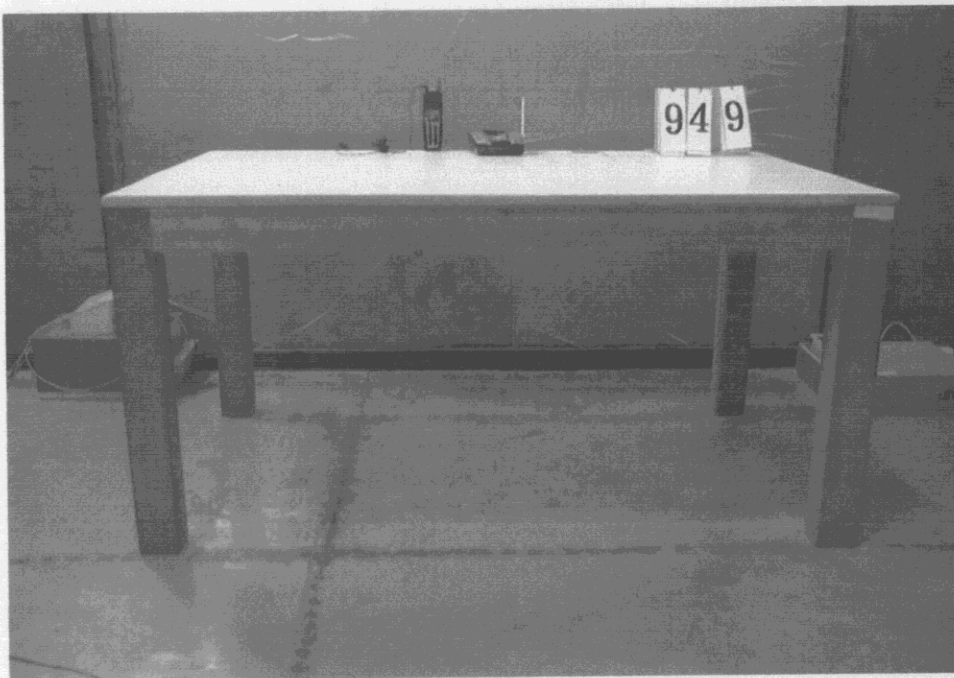
Fig. 2 Conducted Emissions Test Configuration (Operating only)