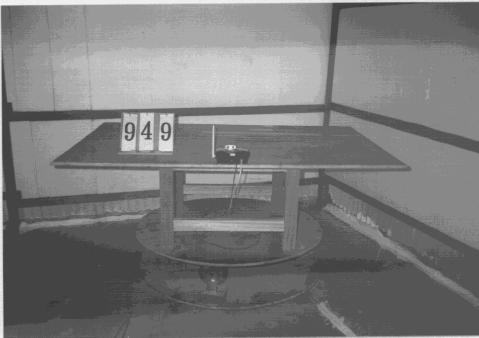
Pic 2 Rear View of the Test Configuration ( BASE )