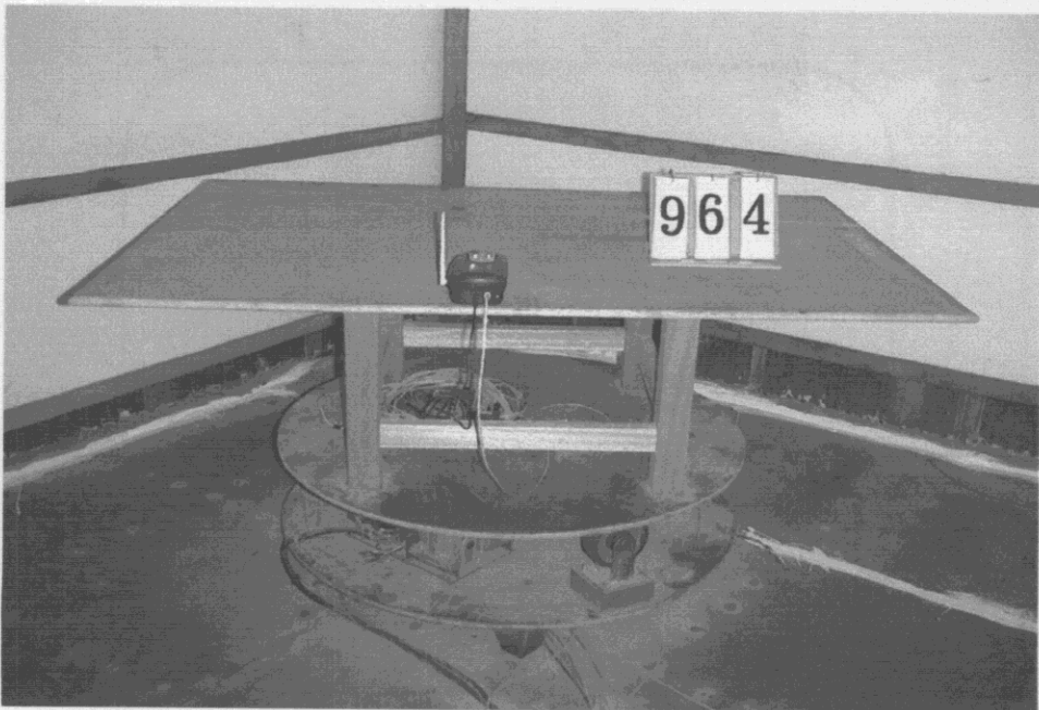
Pic 2 Rear View of the Test Configuration ( BASE )