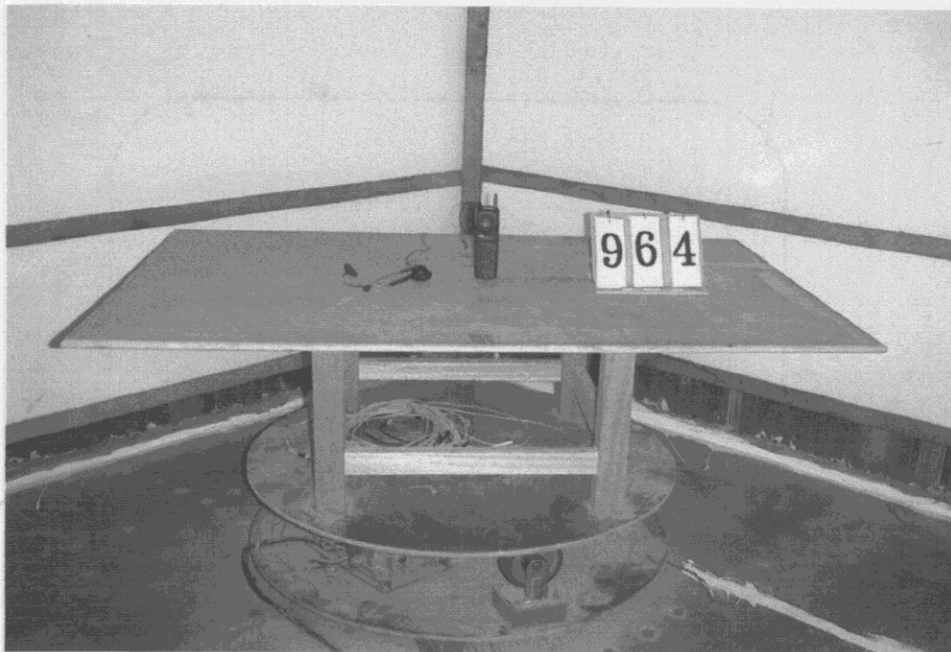
Pic 1 Front View of the Test Configuration (HANDSET)