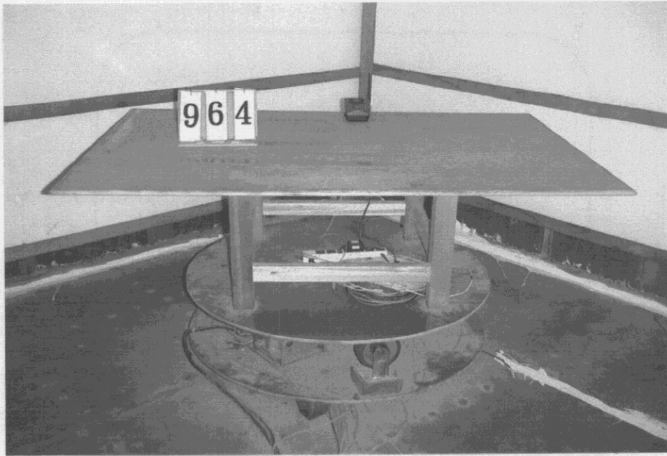
Pic 1 Front View of the Test Configuration ( BASE )