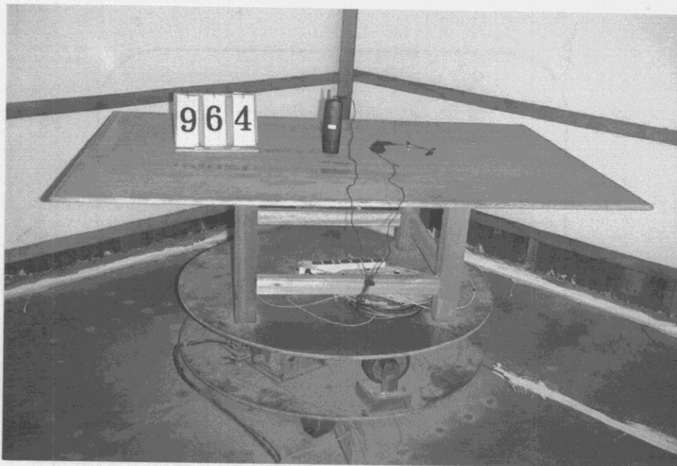
Pic 2 Rear View of the Test Configuration (HANDSET)

The test configuration for frequency between 1 GHz to 18 GHz is same as above.