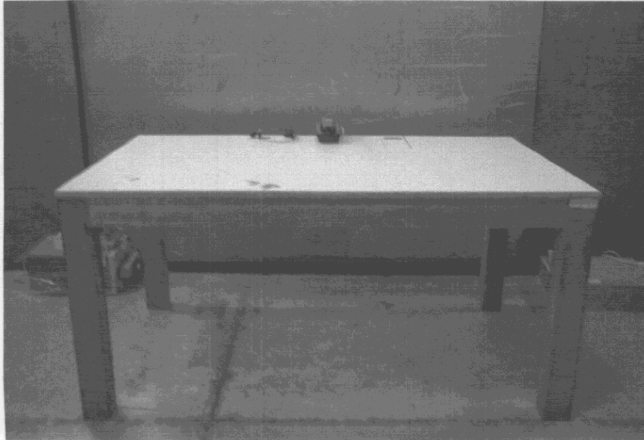
Fig. 1 Conducted Emissions Test Configuration (Idle only)