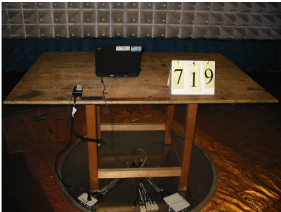
Rear View of the Test Configuration

The test configuration for frequency between 1GHz to 18GHz is same as above.