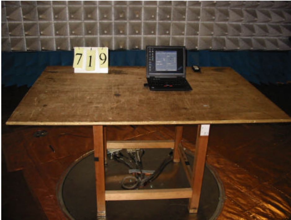
Front View of the Test Configuration