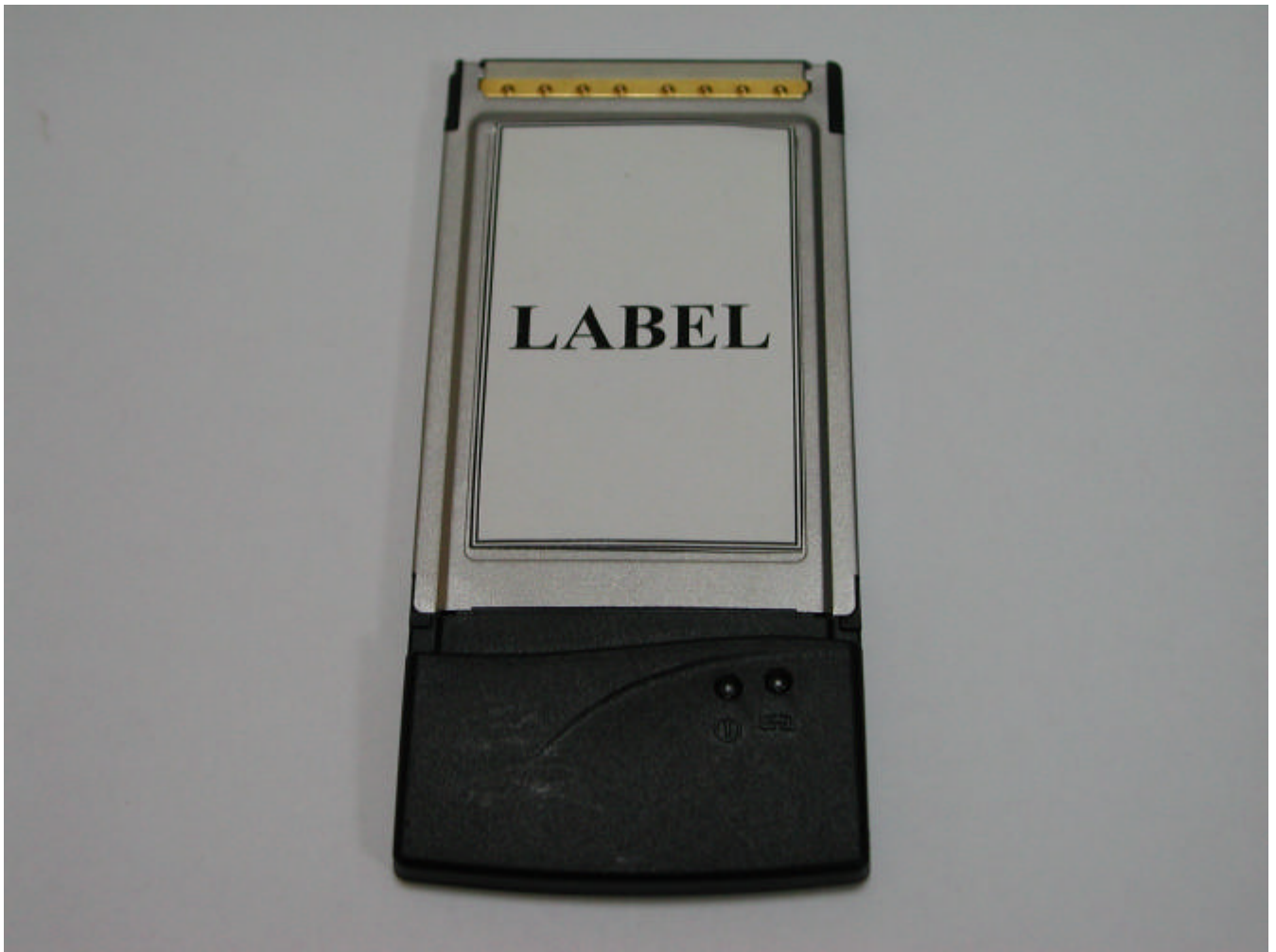
Label Location of the DBTEL DB-6802-L1