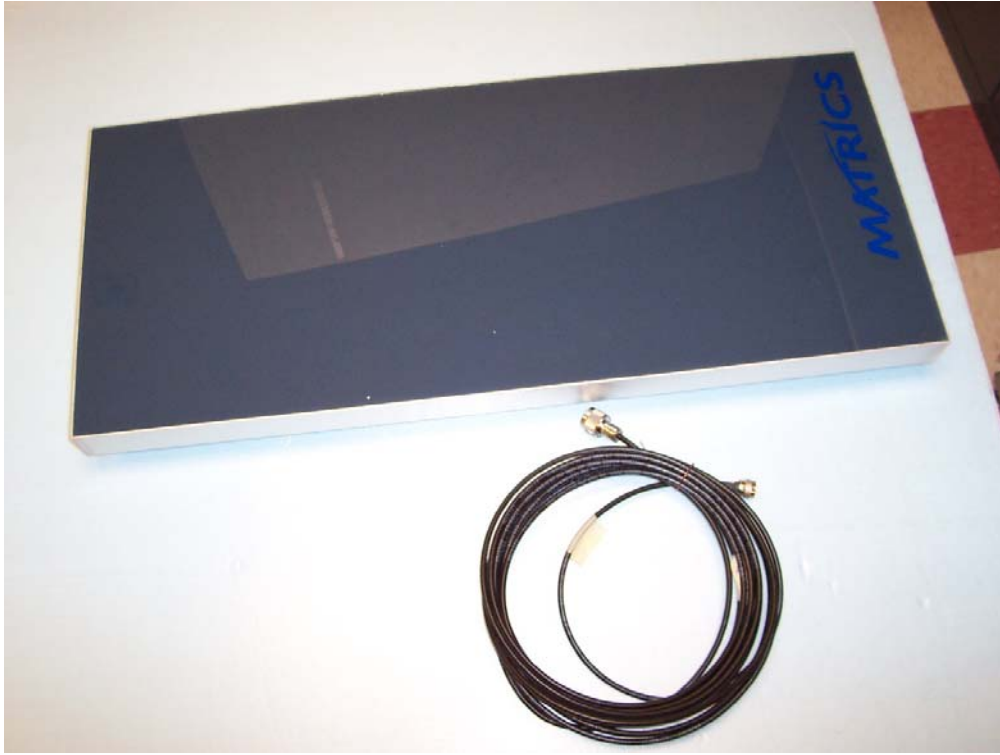
Matrics Series 1 Antenna with supplied 25' coaxial cable

Please feel free to contact me with any further questions.