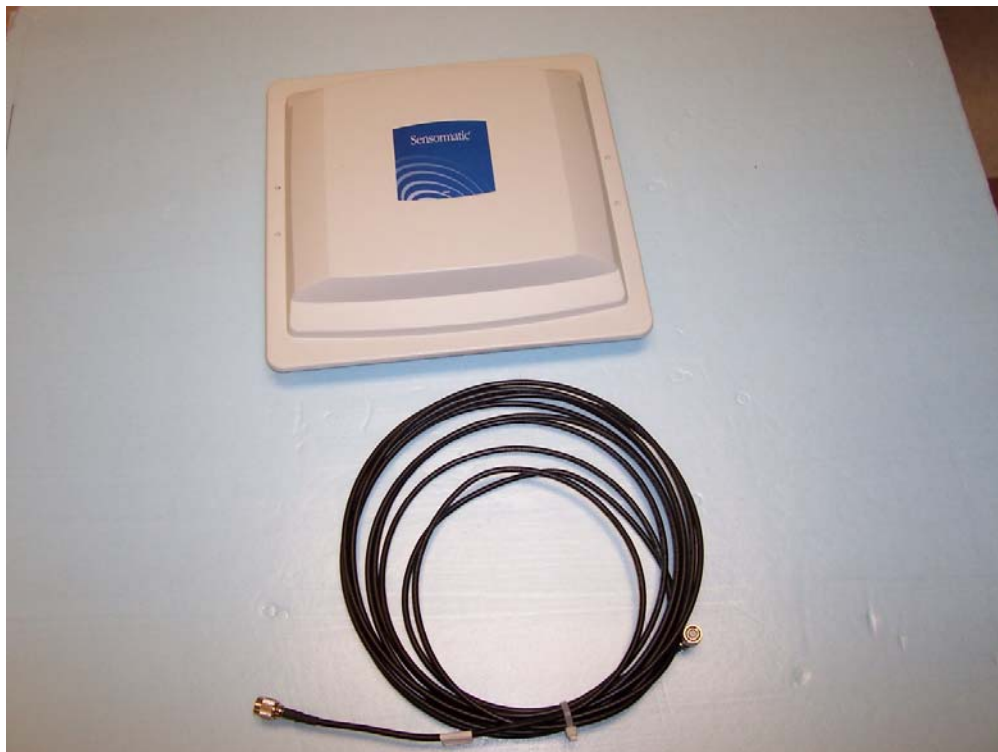
OmniWave Antenna with supplied 25' coaxial cable

2) Please provide photos of the authorized antennas and cables for this device.