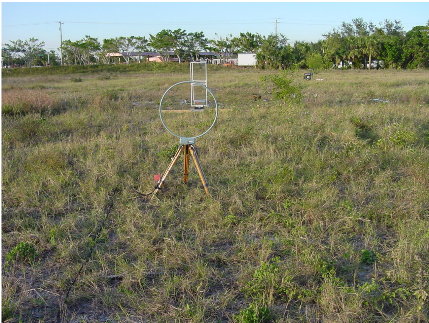
DUT and measuring antenna

FCC ID: BVCAMS9050 IC: 3506A-AMS9050 H-field measurements