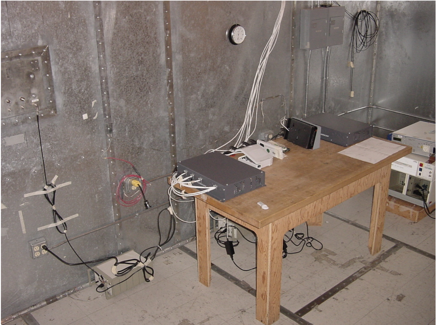
DUT on left corner, accessory layout, antenna cables routed to exit chamber through waveguide.