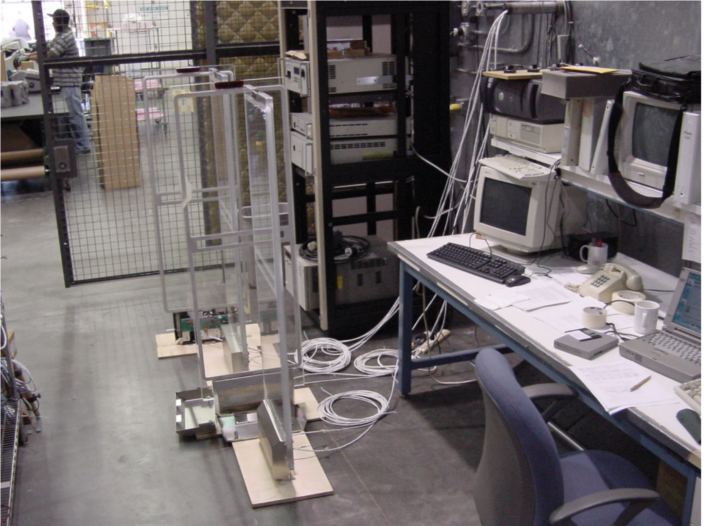
DUT Antennas located outside the shielded room.