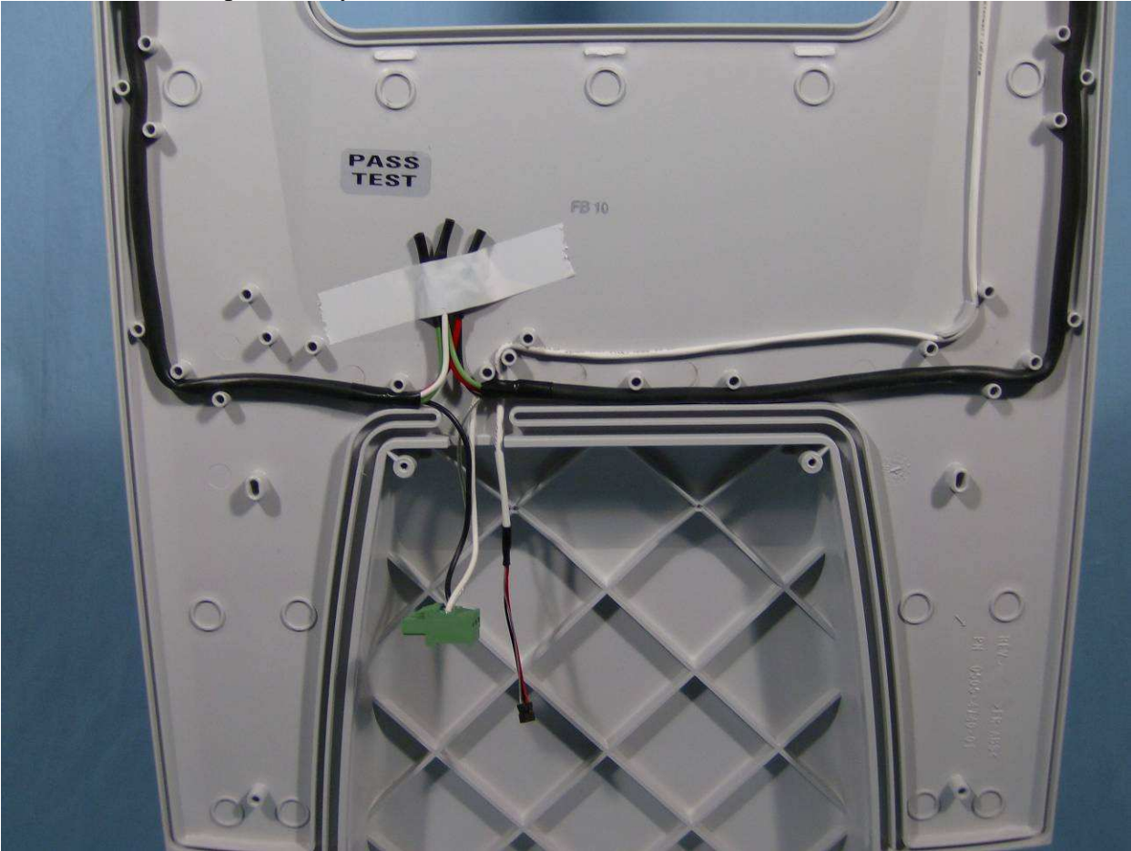
Bottom end of Loop assembly with Alarm LED cable