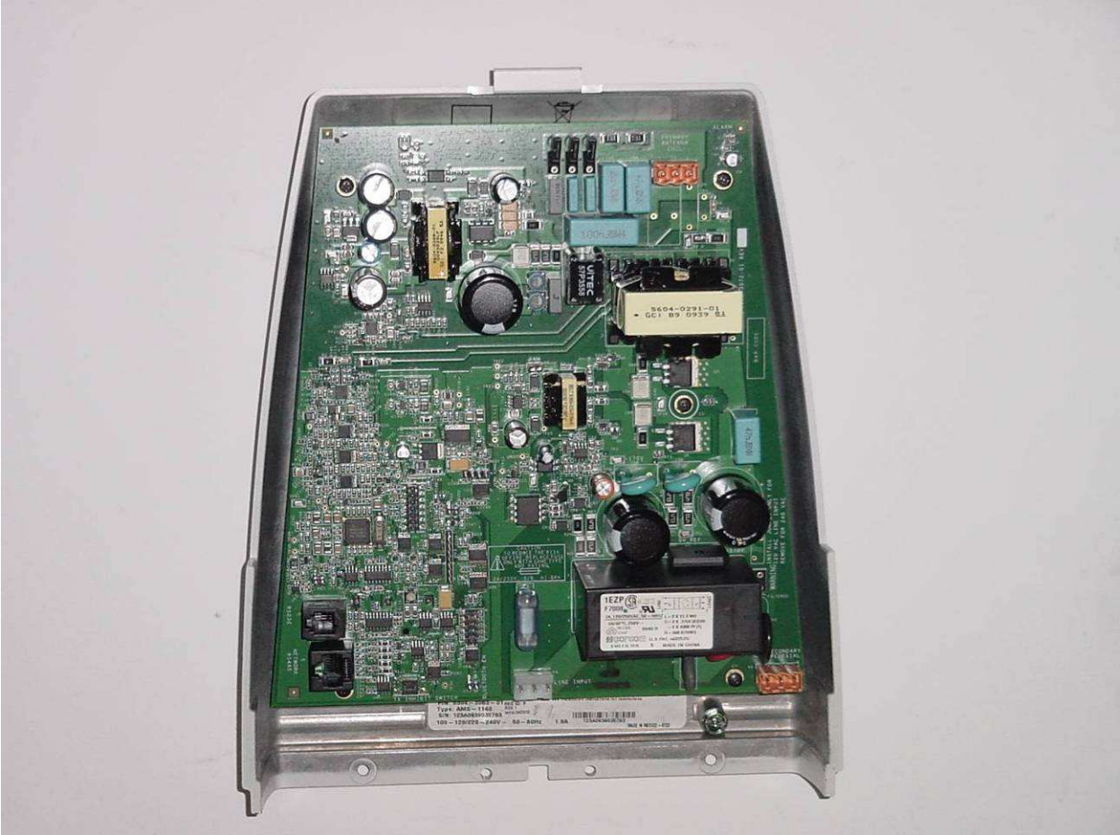
Controller board mounted in chassis