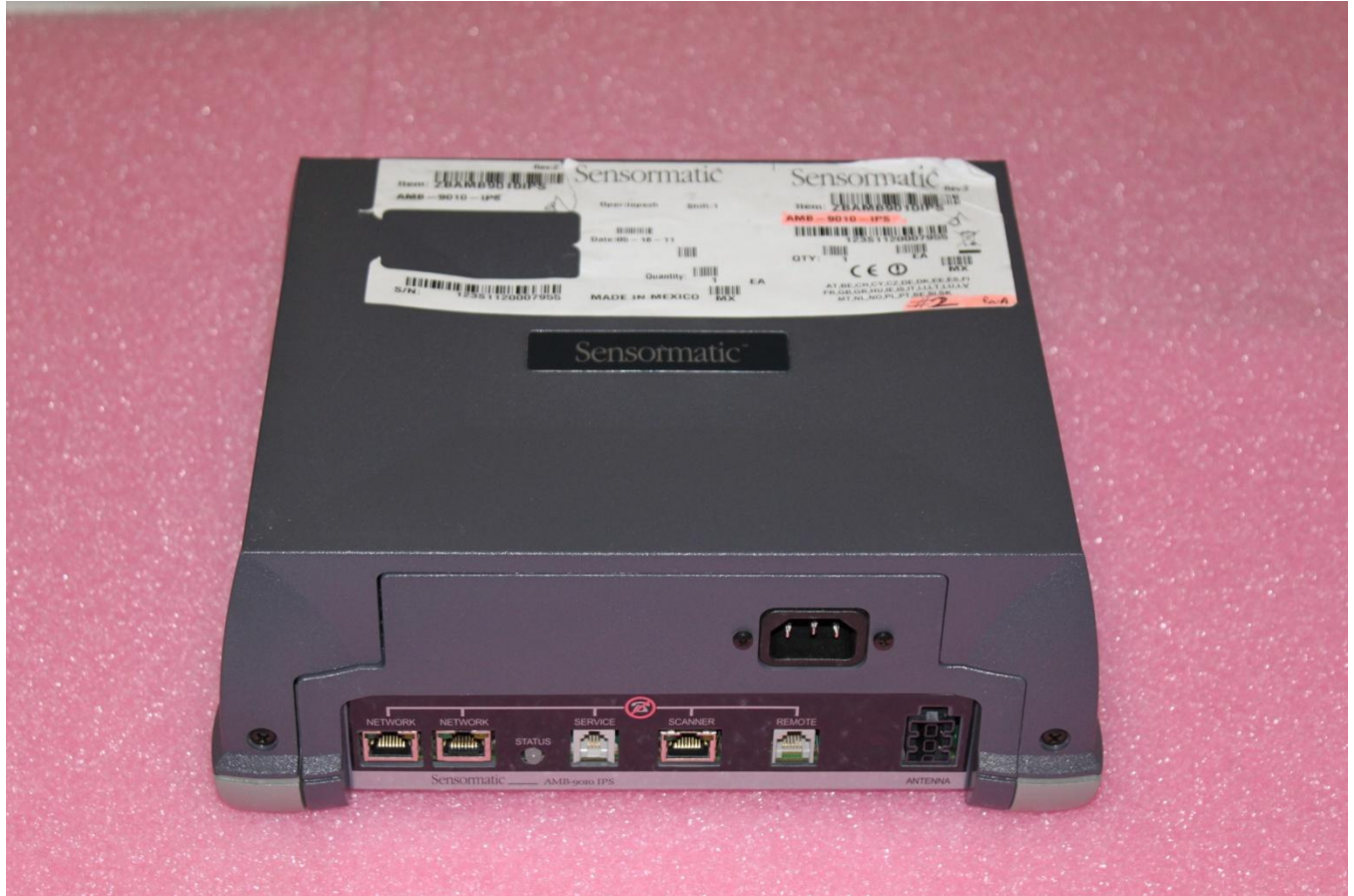
1.3 Closed unit