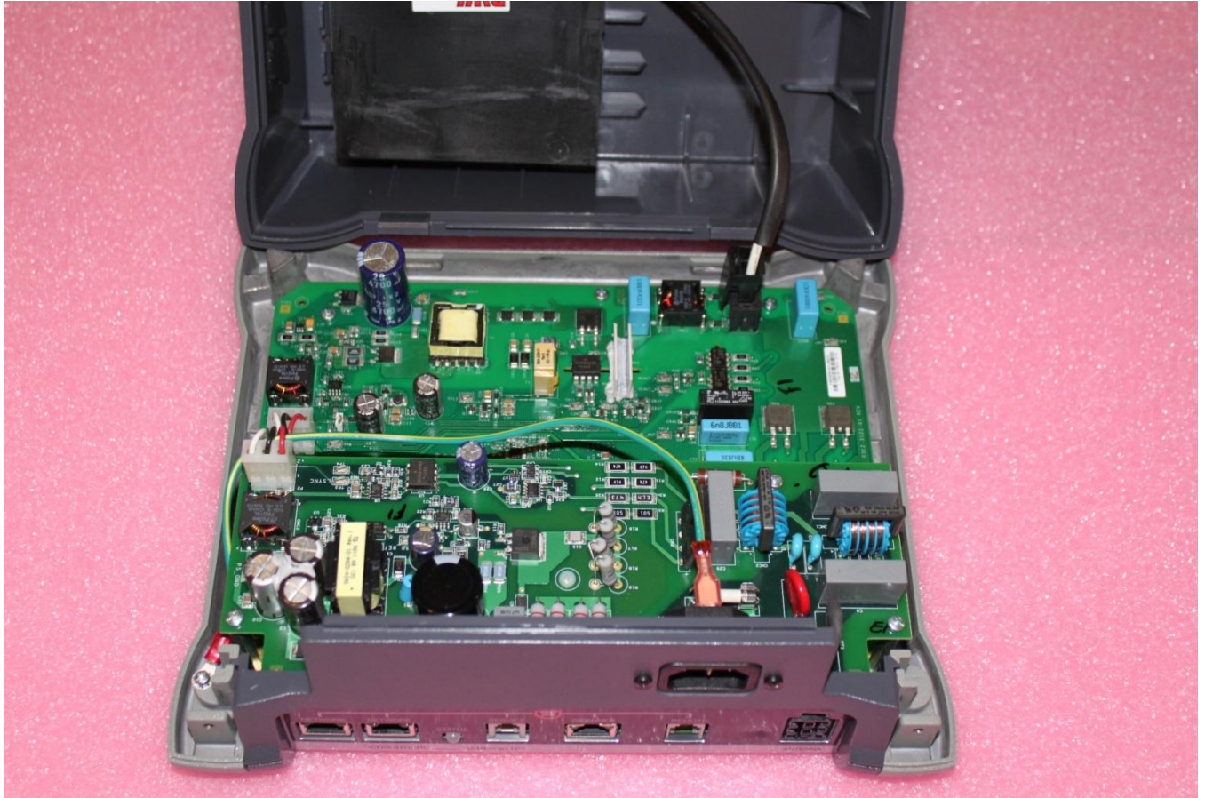
1.2 Connector view