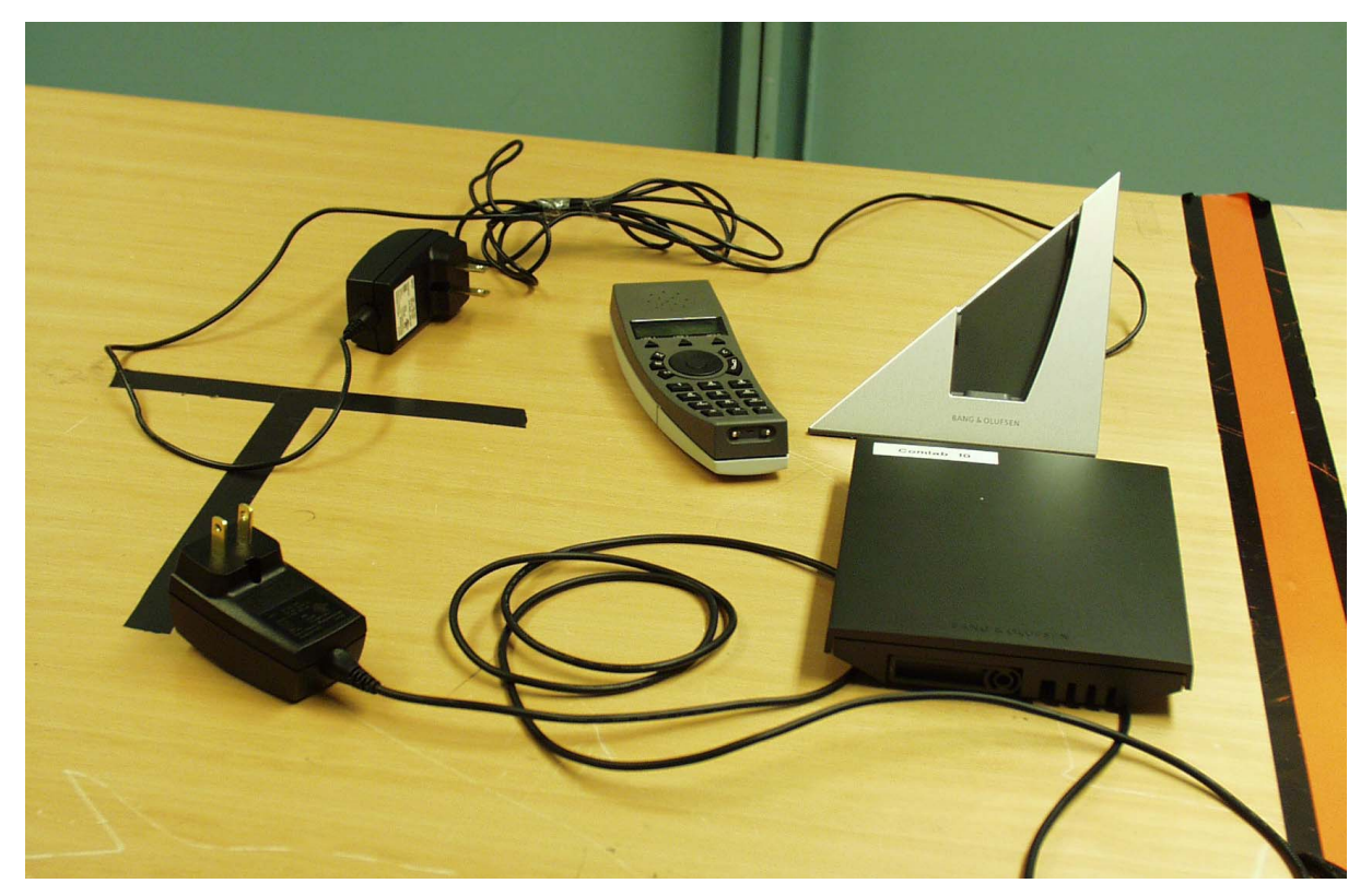
Overview of tested equipment