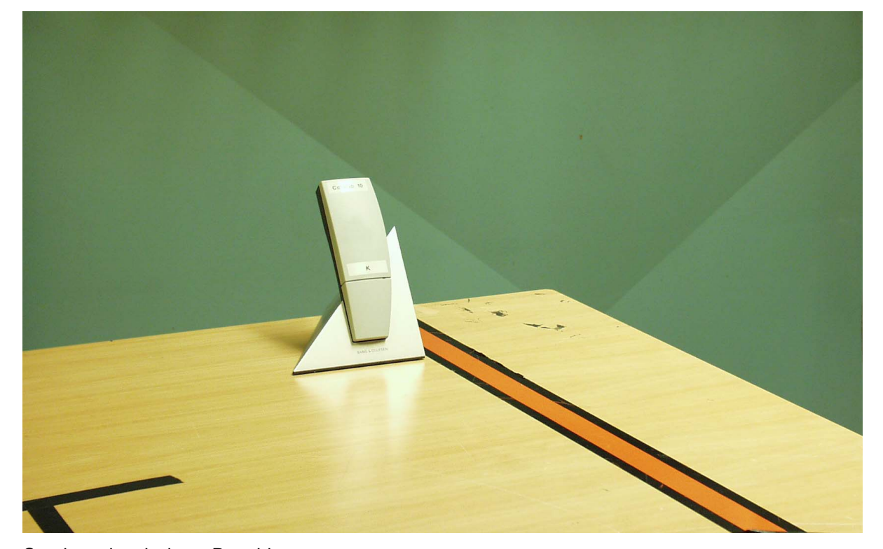
Conducted emissions, Portable