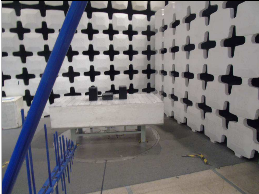
Frequency Range < Above 1GHz >