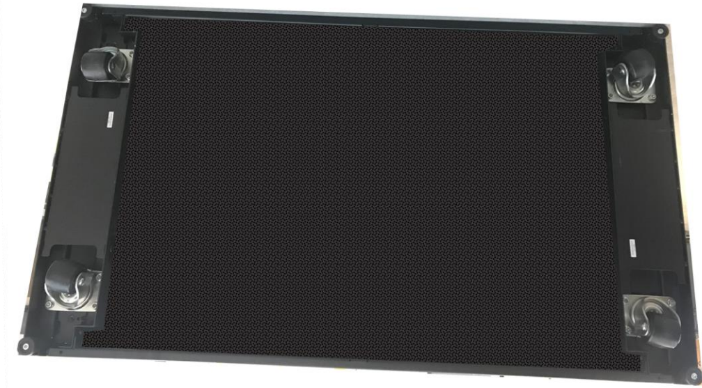
Figure 6. Bottom