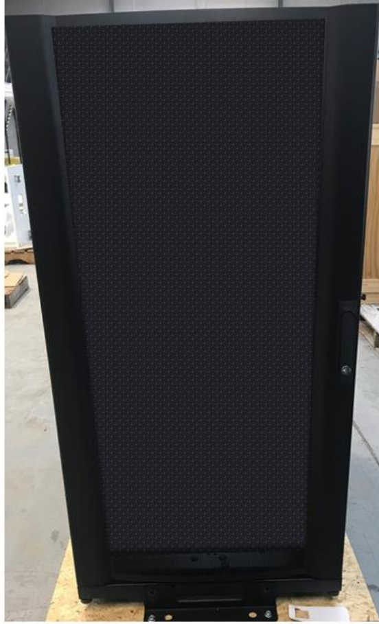
Figure 1. Front