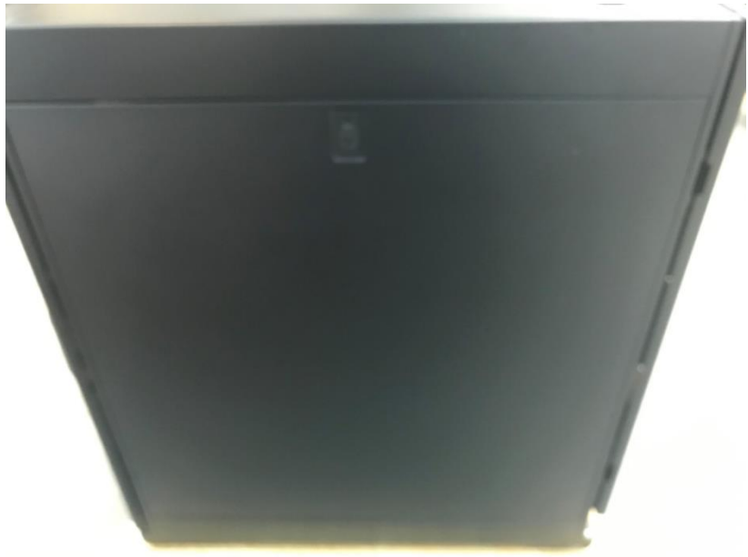
Figure 3. Right Side