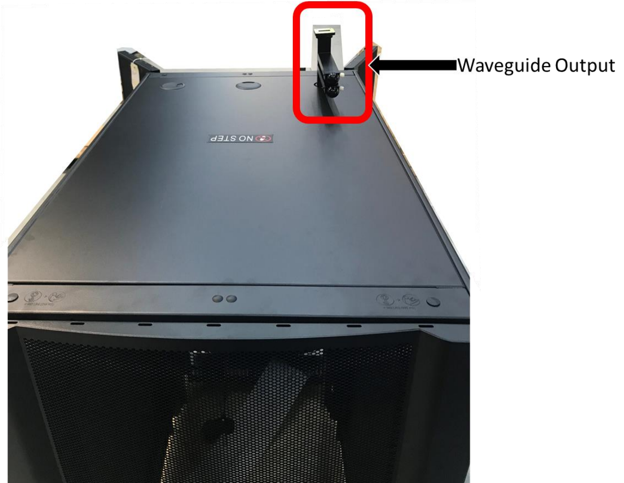
Figure 5. Top