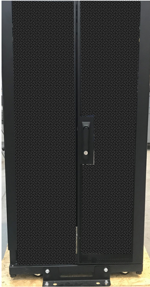
Figure 4. Rear