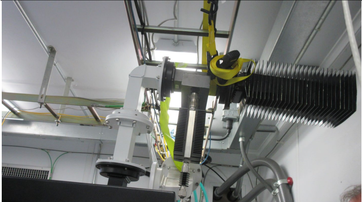
Conducted Test Setup

Enterprise Electronics Model: DEFENDER SK850 FCC ID: BUJ-DEFENDERSK850