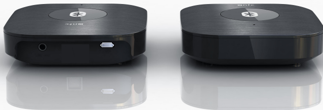
Sobro TV Dongle SOACC021BTBK