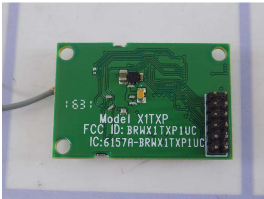
PCB side 2 view