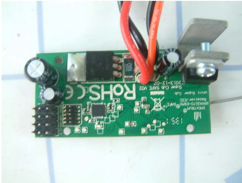
PCB view -1