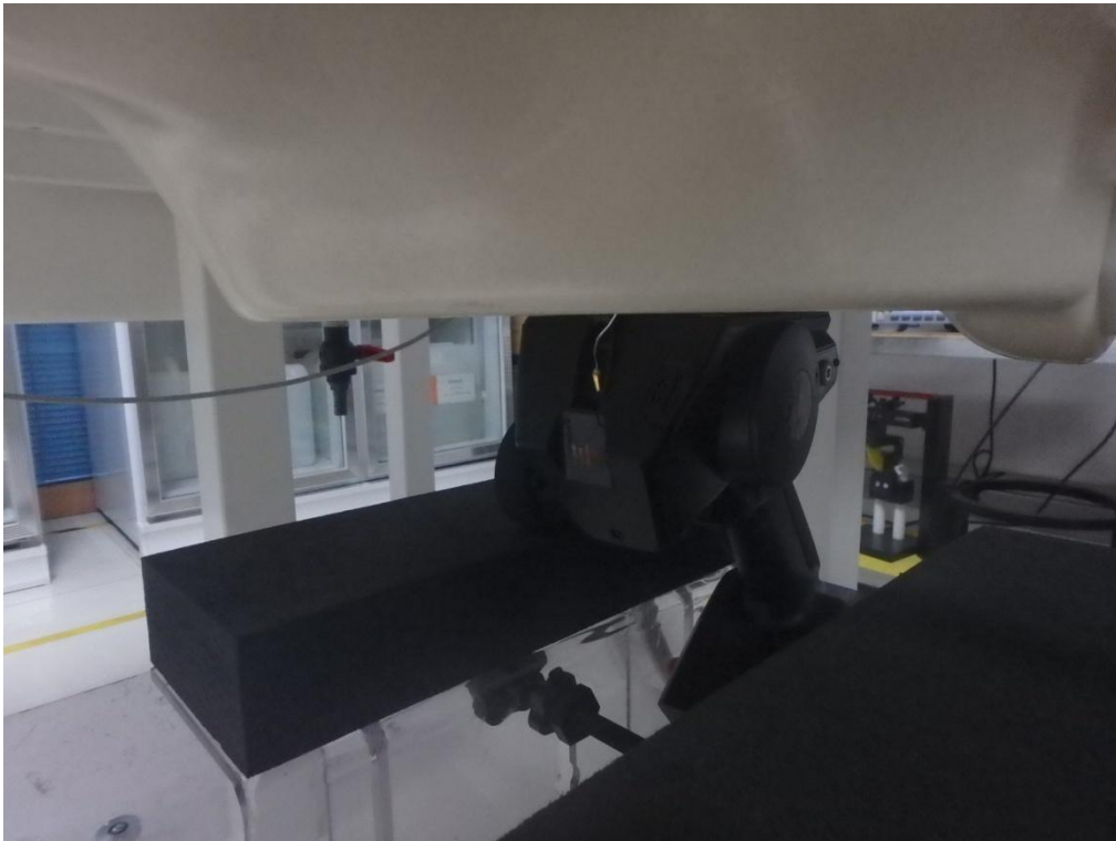
Position 2 of 0mm