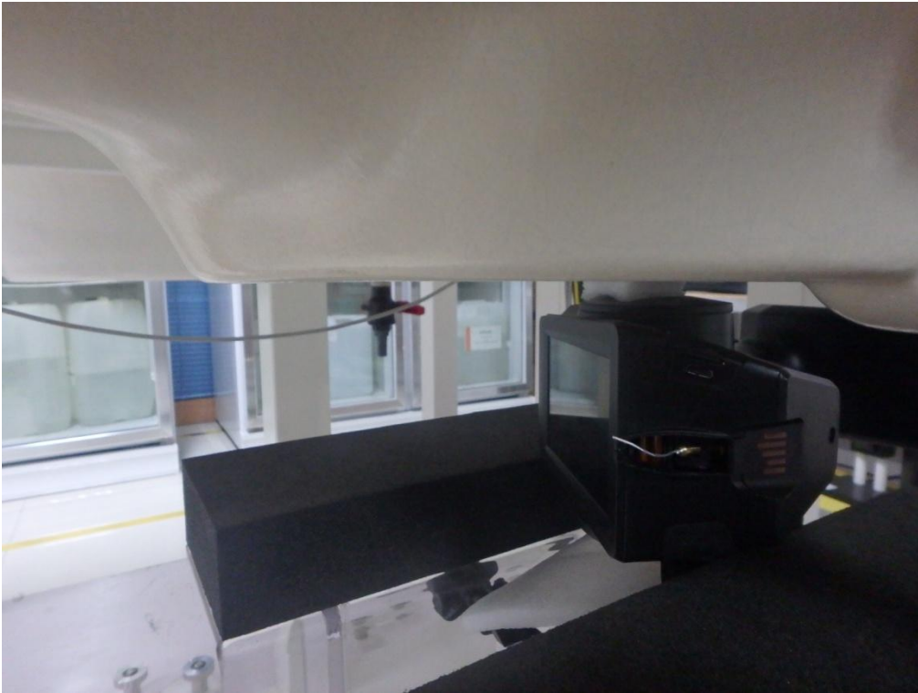
Position 5 of 10mm