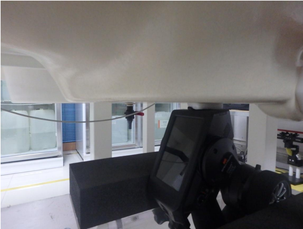
Position 3 of 10mm