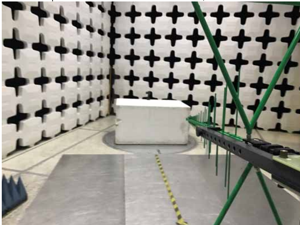
Test Setup for Radiated Emissions – 30MHz to 1GHz, Vertical Polarization