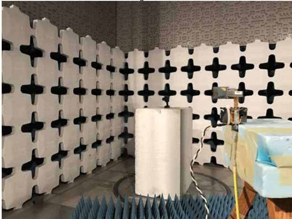
Test Setup for Radiated Emissions – 18GHz to 25GHz, Horizontal Polarization