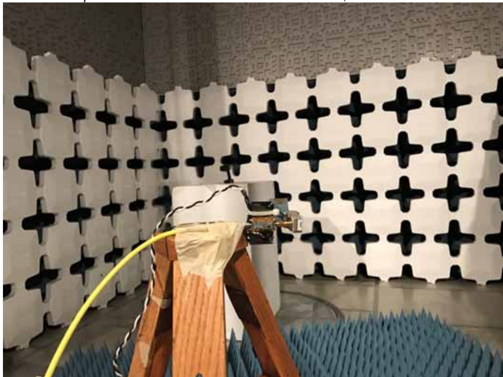
Test Setup for Radiated Emissions – 18GHz to 25GHz, Vertical Polarization