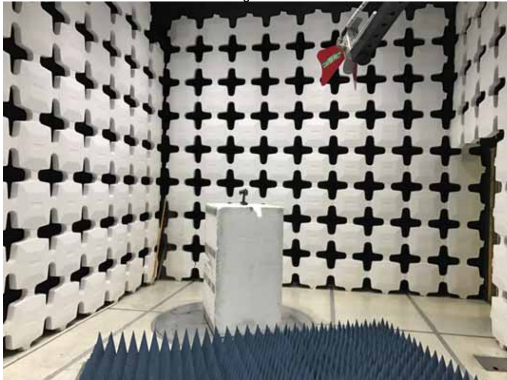
Test Setup for Radiated Emissions – 2GHz to 18GHz, Horizontal Polarization