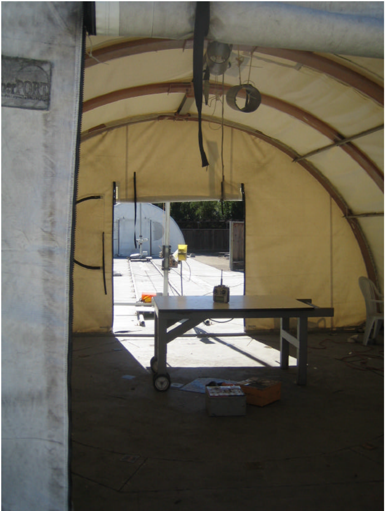
Test fixture upright for radiated emissions measurements