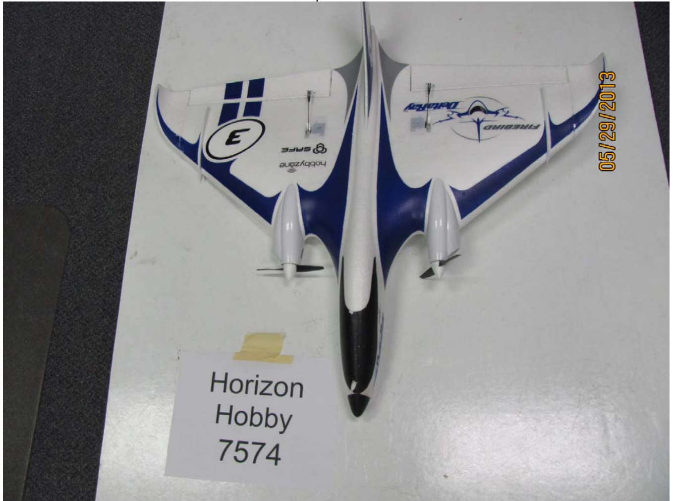
Top of EUT