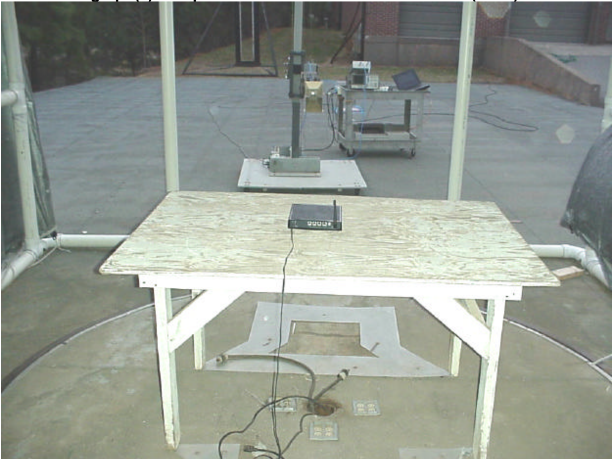
Photograph(s) for Spurious and Fundamental Emissions (Back)