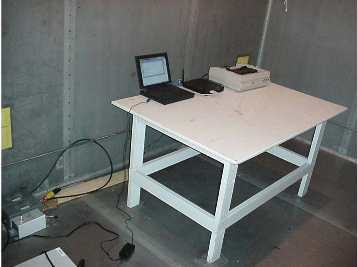
Photograph(s) for Conducted Emissions