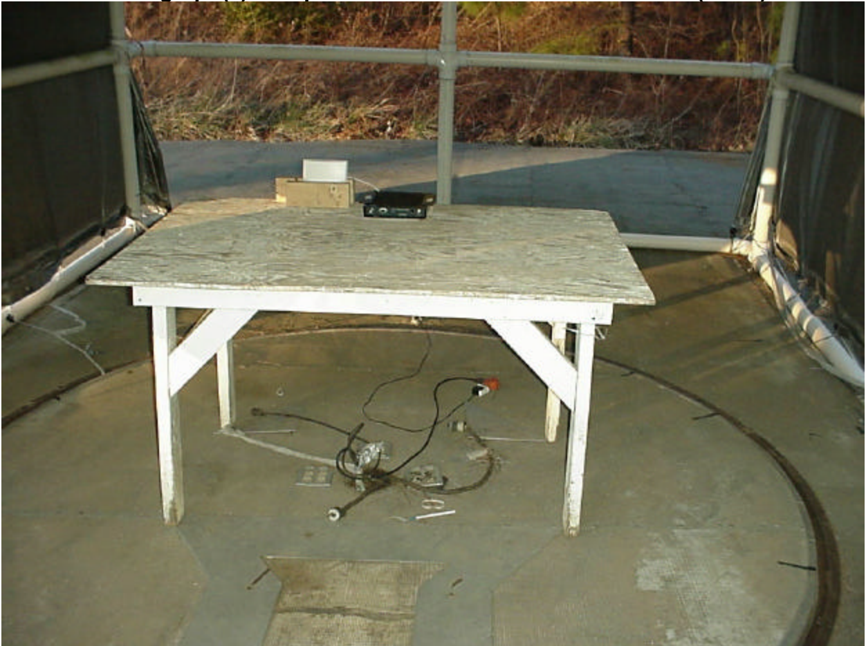
Photograph(s) for Spurious and Fundamental Emissions (Front)