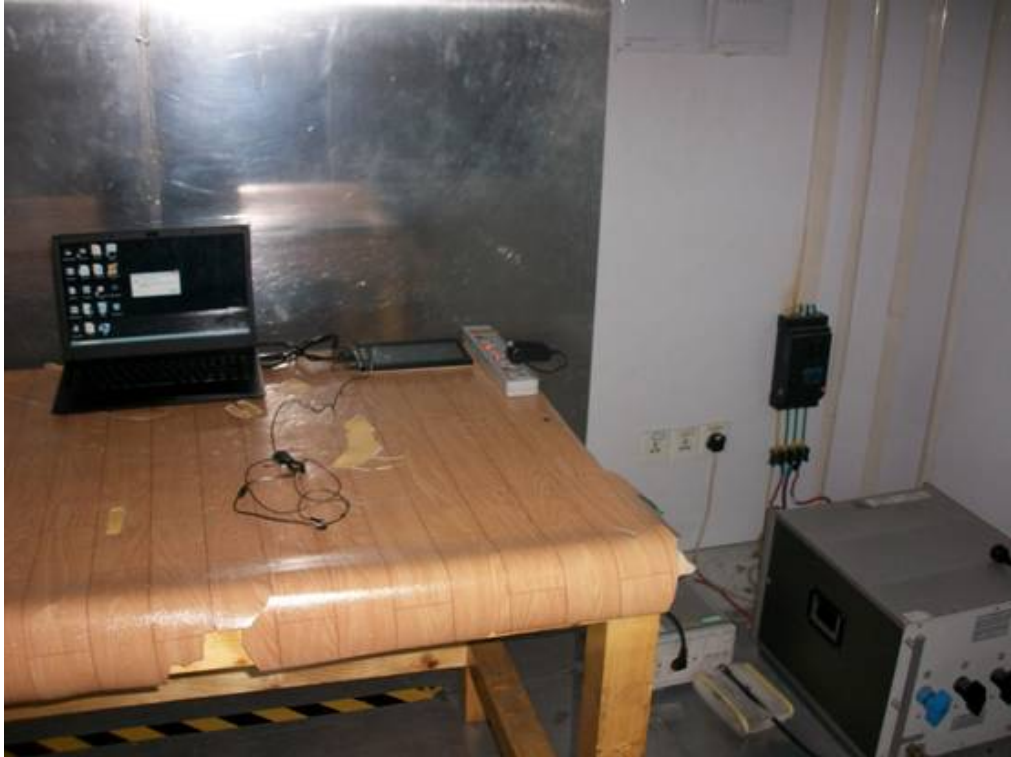
CE TEST SETUP