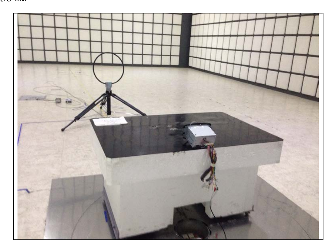
* 30 MHz \sim 1 GHz