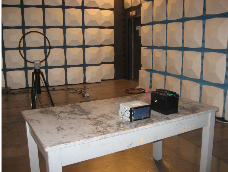
Photograph 1: Set-up for Radiation Measurement below 1GHz