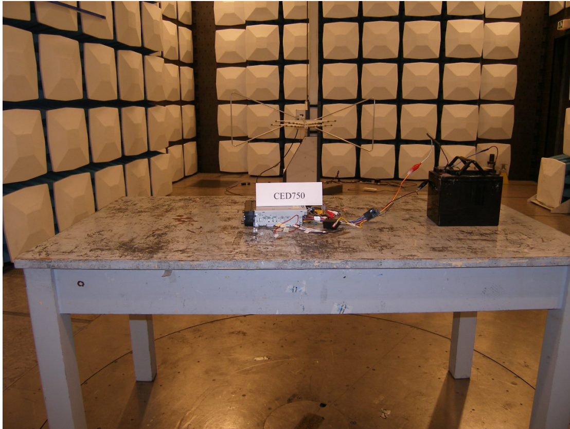
Photograph 1: Set-up for Radiation Measurement below 1GHz